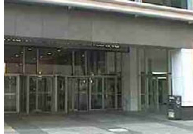
1600 Pacific - Current Condition