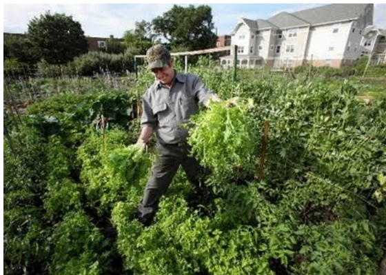
1. For profit urban garden in Cleveland