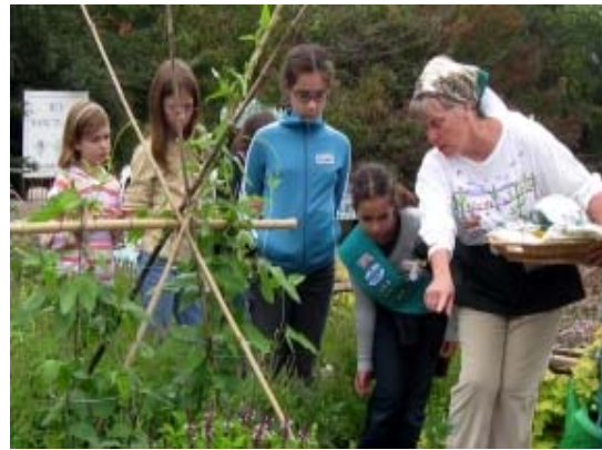
Lake Highlands (public/private)