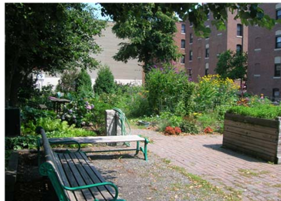
2. Relaxation garden in Boston