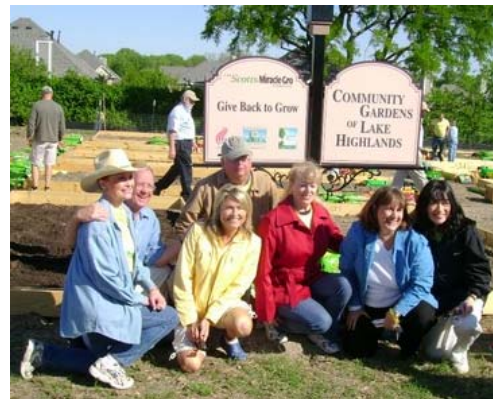
Lake Highlands (public/private)