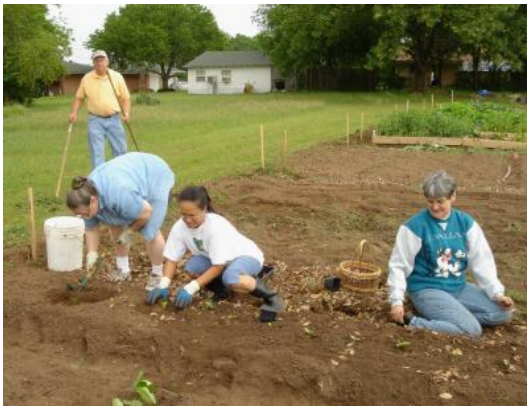
Our Savior (religious institution)