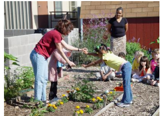
Kramer School (education institution)