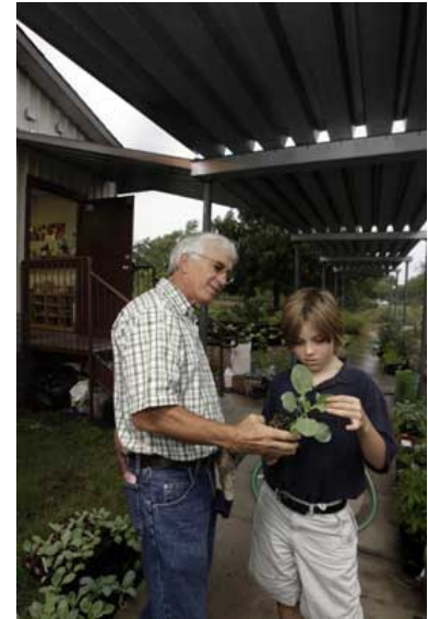
4. School garden in Dallas