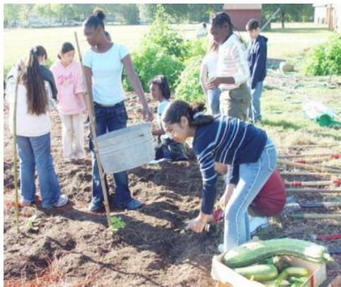
Our Savior (independent)