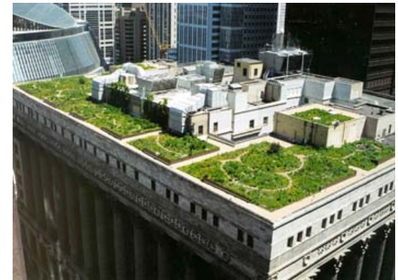
3. City Hall rooftop garden in Chicago