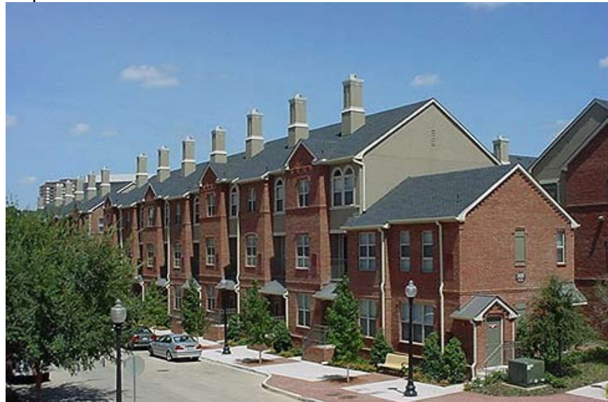
New housing types such as these townhomes will comprise the majority of new housing development in Dallas.

The Housing Element looks toward the future of housing in Dallas while keeping an eye on current conditions. It examines housing needed in the city's future and planned for as part of the forward-Dallas! Vision. In addition, it uses the forwardDallas! Guiding Principles to develop policies addressing issues such as changing housing preferences, innovative products, affordability and ownership.