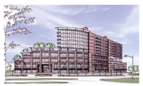
Higher density housing ranging from high-rise towers (above at 1400 Turtle Creek) to low-and mid-rise buildings will be important if Dallas is to accommodate a projected 200,000 new households.

oals and Policies of the Housing Element are organized into three classifications: supply, demand and affordability. Some issues, such as ownership, which is impacted by affordability and supply, are addressed under more than one classification