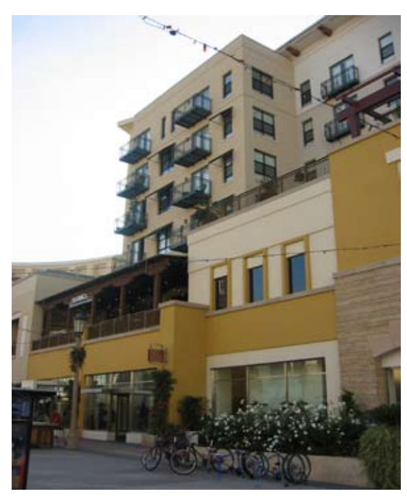
New housing should also include services and amenities targeted toward newcomers.