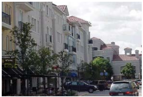
New zoning regulations should encourage the development of mixed-use buildings as illustrated above.