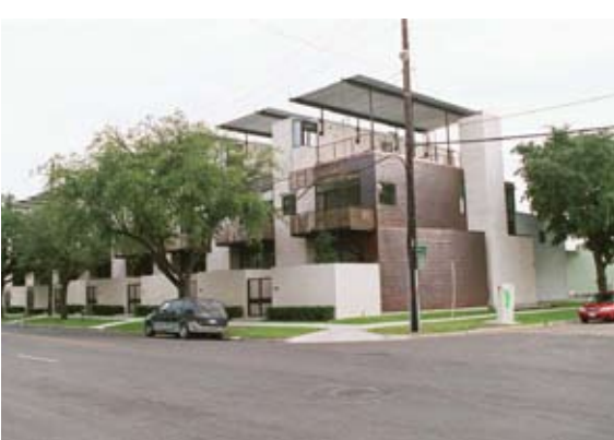
Smaller lot homes, and other alternatives such as townhomes and condominiums, will enable more Dallas residents to become homeowners.