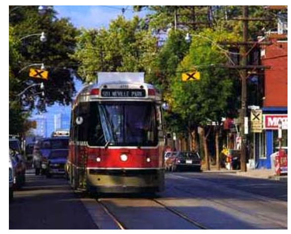
Streetcars are designed for local transportation and are most successful when tied into the local transit system. These transit vehicles are powered by overhead electricity and streetcar models range from modern to antique.