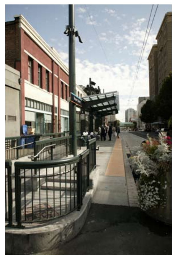
The city of Tacoma streetcar station provides a pedestrian shelter with disability access.