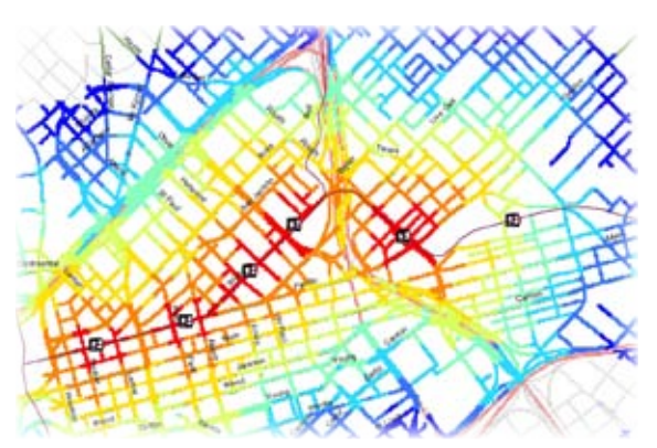
This map shows Downtown transit access within walking distance. The red color indicates good service while areas in blue would benefit from new lines and connections.

6. Review of possible financing, governance and implementation options: Solid research will be needed to decide how to best pay for a streetcar system. The action plan will include a summary of how other streetcar systems have been financed along with a list of likely sources of funding. An operating plan will be created for each alternative streetcar route based on weekday, weekend and