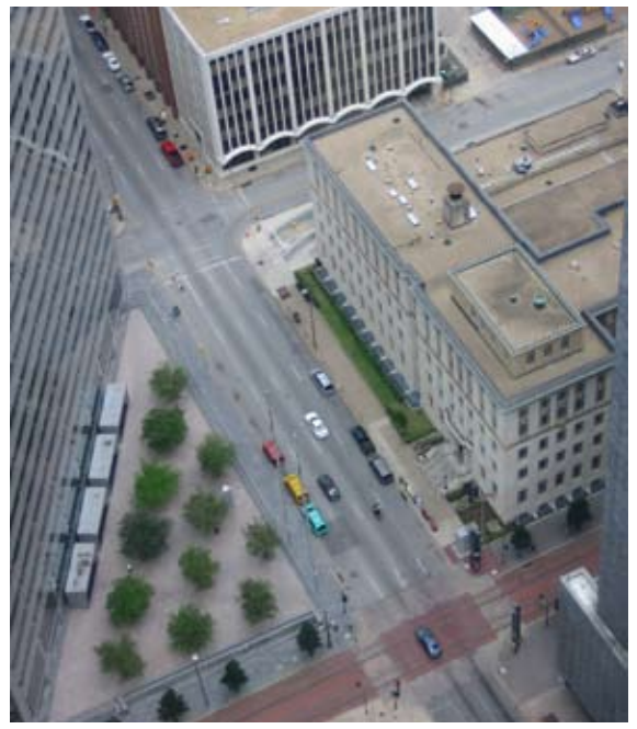
Downtown Dallas street widths provide enough space for installing a streetcar.