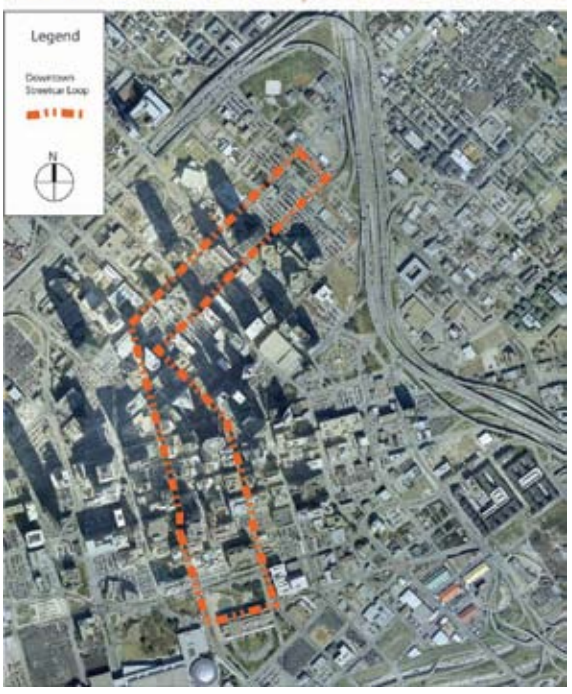
A Downtown streetcar could be routed through the Downtown area and into the Arts District.

Downtown Dallas - Proposed Streetcar Line