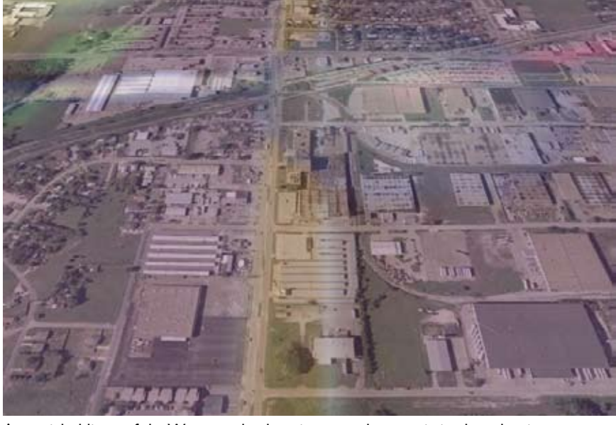
An aerial oblique of the Westmoreland station area shows existing low-density development with buildings usually no more than one story tall.