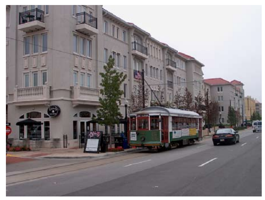
A new street design for the Westmoreland station area could incorporate vegetated medians, brick crosswalks, signalized intersections, wide sidewalks with street trees, and street parking in front of businesses oriented to the street (above).

It will be necessary to assess the capacity of infrastructure such as sewer, water, drainage and flood protection. In addition, other services such as police, fire, and public safety, transit, parks, and school services should be contemplated to make sure they keep pace with growth. Emphasis will be placed on sustainable development when planning to expand these services.