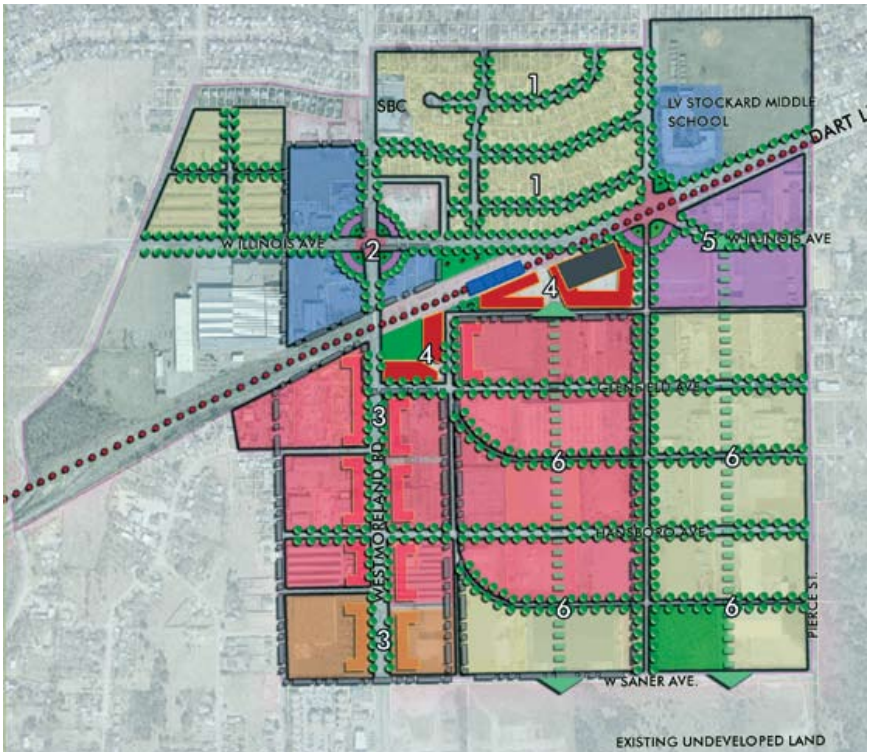
The Westmoreland Concept Plan map calls for new commercial development in red, multifamily housing in purple, civic uses in blue, compact neighborhood development in orange and surrounding single-family residential housing in yellow. Throughout, new street trees will improve the streetscape.