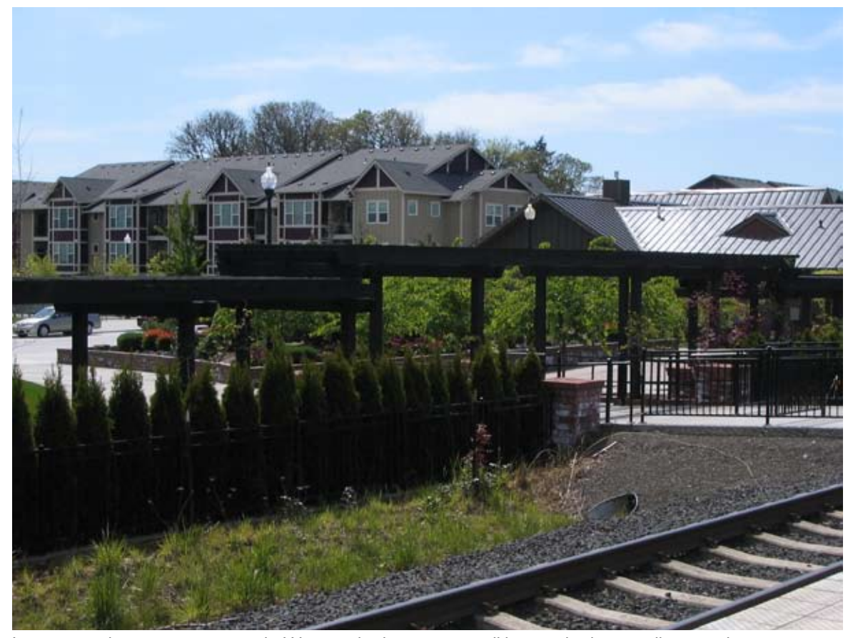
Locating new housing options near the Westmoreland station area will boost ridership as well as provide a convenient and low-cost alternative to the car.

An Area Plan for the Westmoreland Transit Station neighborhood will help secure quality, economically vibrant and culturally significant development. Embracing sustainable development will attract future investment and perhaps become a showcase for transit oriented development in Dallas. This Southern Sector project will provide new housing options and opportunities for homeownership. With savvy utilization of the land and transit options, this whole area will rely less on cars, helping the city manage congestion and reduce transportation costs for residents.