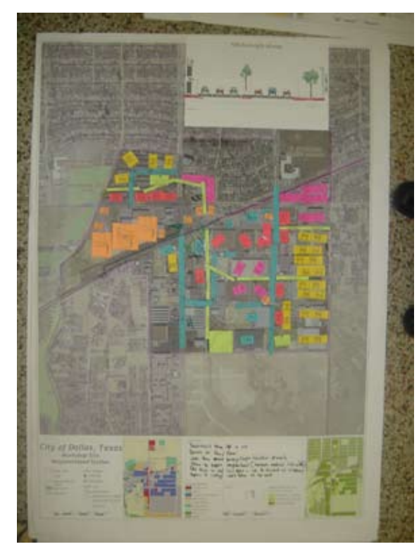
Westmoreland workshop participants designed new streetscape cross-sections and determined what land uses should surround the area. Their ideas helped inform the concept plan map.