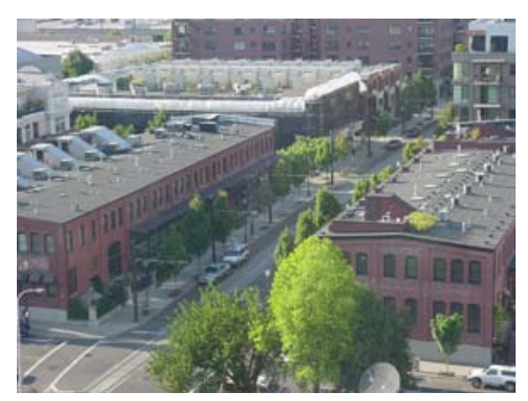
New zoning regulations will guarantee a diverse mix of building and development types appropriate for a multimodal corridor.