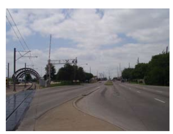
The lack of surrounding development near Westmoreland Station presents a blank slate for implementing new ideas.

Sustainable development, for example, may incorporate storm water drainage measures such as permeable pavement, eco-roofs, rain gardens or vegetated bioswales that capture and naturally filter run-off from paved or hard surfaces. This reduces the demands of municipal sewer systems, naturally restores ground moisture and is aesthetically pleasing with streetside plantings and natural landscaping. The result: Less demand on municipal services, healthier ground moisture, and more pleasant walkways, and pockets of greenery.