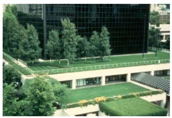
Eco-roofs reduce storm water run-off from roofs and offer pleasant landscaping for building tenants. Vegetated roof treatments help cool the building in the summer and provide added insulation in the winter.