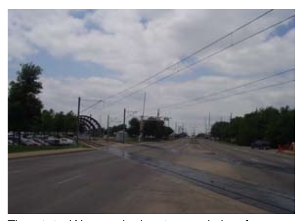
The existing Westmoreland station area lacks safe crossings or an attractive streetscape amenable to pedestrians.