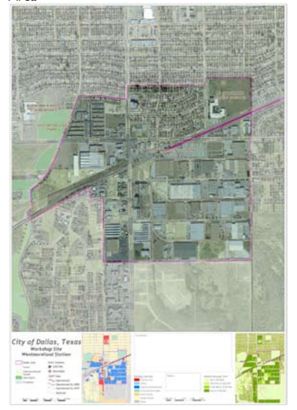
The Westmoreland DART station area has great potential to become a model for sustainable development.