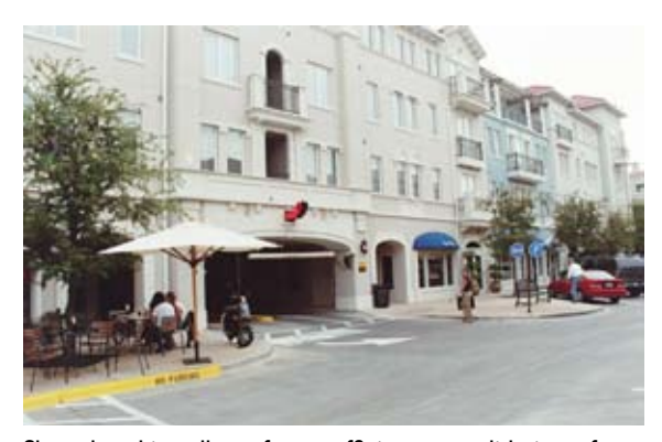
Shared parking allows for an efficient consolidation of parking stalls in order to avoid the waste and blight of large empty surface parking lots.