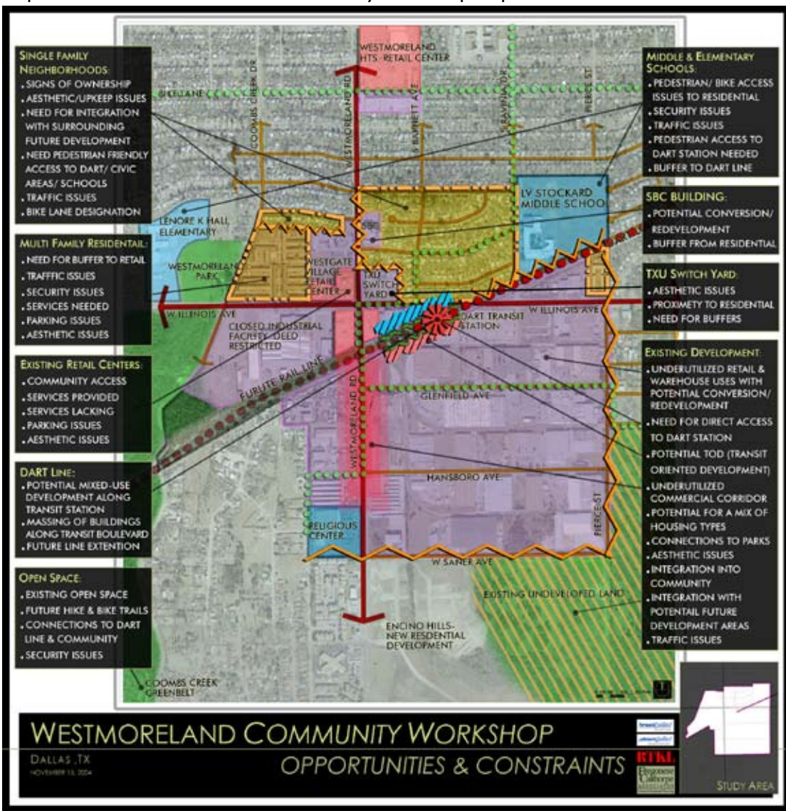
Map III-2.25 The Westmoreland Community Workshop Map

The Westmoreland station area consists of underutilized retail and warehouse buildings that could be converted into new mixed-use buildings offering different types of housing such as live/work spaces, condos or apartments.