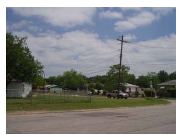
Housing options in the Westmoreland station area are predominantly single-family detached homes. Most residents access the DART station by driving and parking.

s part of this Area Plan, the City's Capital Improvement Program needs assessment should be reviewed to consider new, relevant projects. In addition, other ways to fund proposed capital improvements must be identified. Developing an economic program for the area will help determine the best ways to leverage public and private investment and to implement methods to stimulate and support the job market. Key private investments and specific industries should be identified and targeted to jump-start the plan.