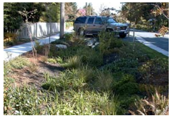
A neighborhood bioswale absorbs water run-off and filters road and parking pollutants on-site utilizing principles of storm water management.