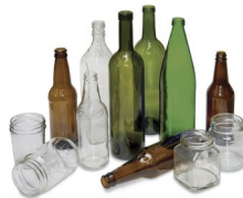
Glass Bottles & Containers