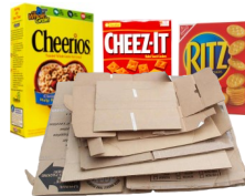
Cardboard & Boxboard