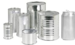
Aluminum, Steel & Tin Cans