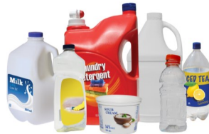
Plastic Containers (#1-5, 7)