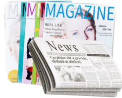
Mixed Paper (e.g. office paper, news-paper, magazines)