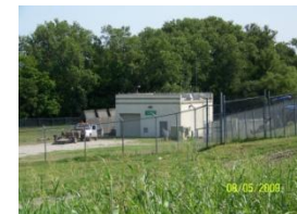
Rochester 4 pumps – 84,900 gpm