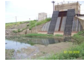
Pavaho (drainage area - 1,843 acres) 3 pumps – 82,000 gpm

gpm – gallons per minute MGD – Million Gallons per Day