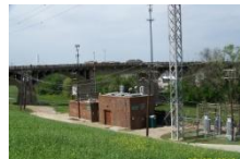
Able (drainage area - 1,813 acres) 6 pumps – 226,000 gpm