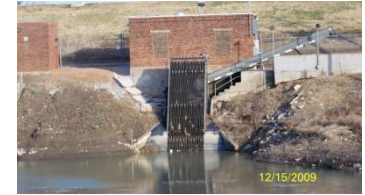
Delta (drainage area - 815 acres) 3 pumps – 86,000 gpm