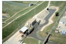
Baker (drainage area - 3,418 acres) 10 pumps – 614,000 gpm