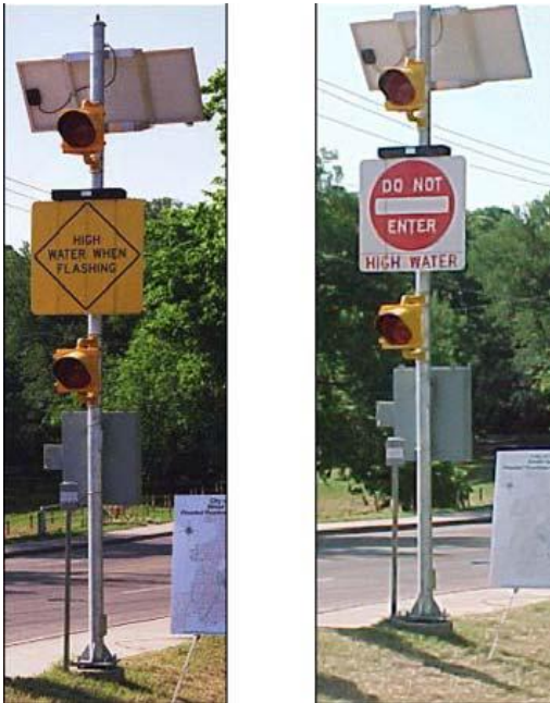
Flooded Roadway Warning System (FRWS) Site