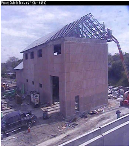
New Pavaho 2012