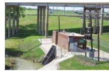
Charlie (drainage area - 779 acres) 3 pumps – 86,000 gpm

gpm – gallons per minute MGD – Million Gallons per Day