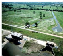
Hampton (drainage area - 6,355 acres) 11 pumps – 608,500 gpm