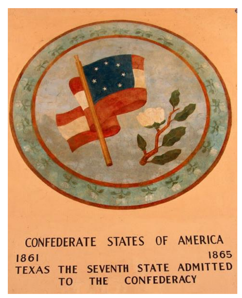
Confederate Roundel, 1936