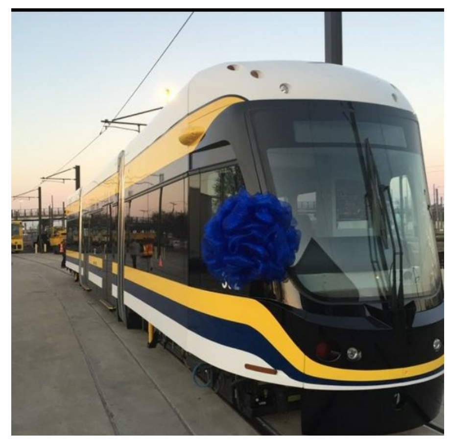
Dallas Area Rapid Transit 's latest Streetcar

DART - There are two projects going forth to increase the core capacity of the DART Light Rail system; the construction of a second rail corridor through downtown Dallas - known as D2 to "increase system capacity, provide operational flexibility and serve new markets." The Streetcar Network, the second project was created to connect the Oak Cliff Streetcar line with the Mckinney Avenue Streetcar line.