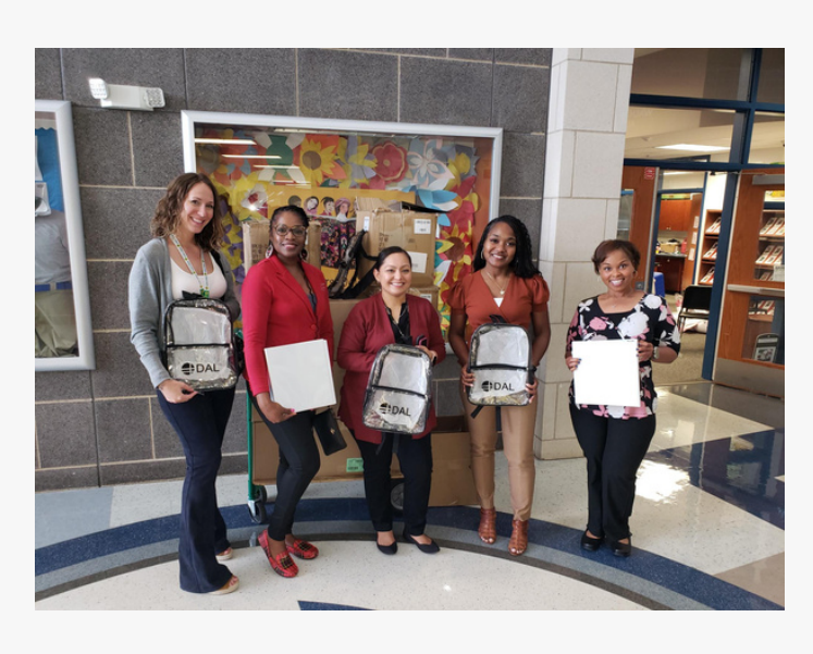
YOUTH & EDUCATION