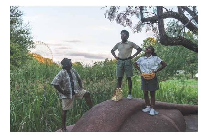
In Spite of History Pt. 1