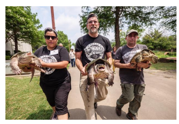
Texas Turtle Day