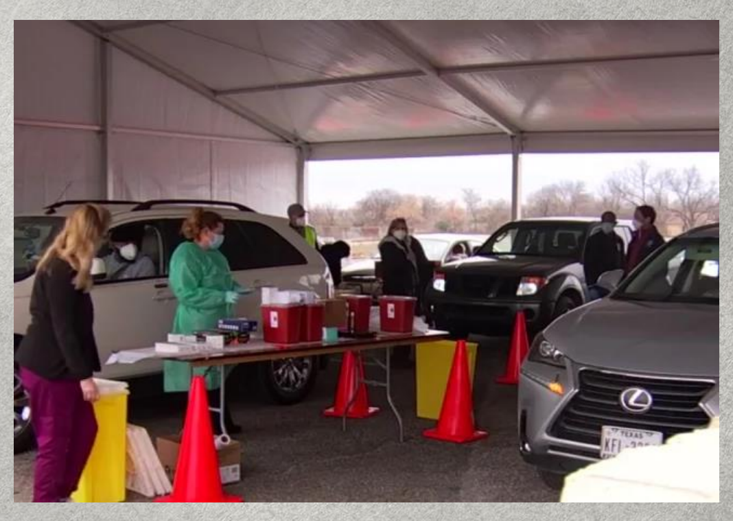
COVID-19 Testing Site