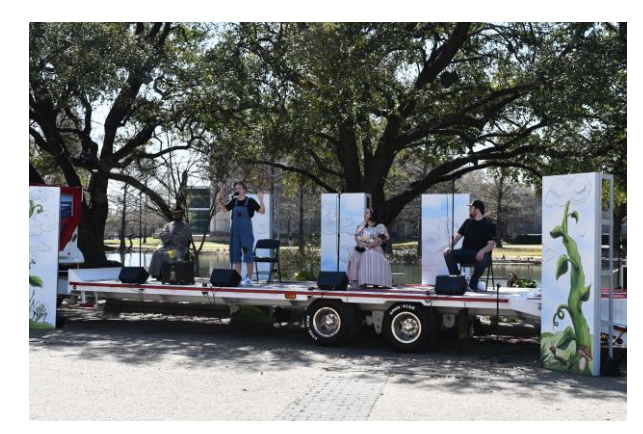
Opera in the Park