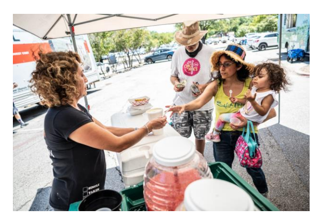
MLK Food Park