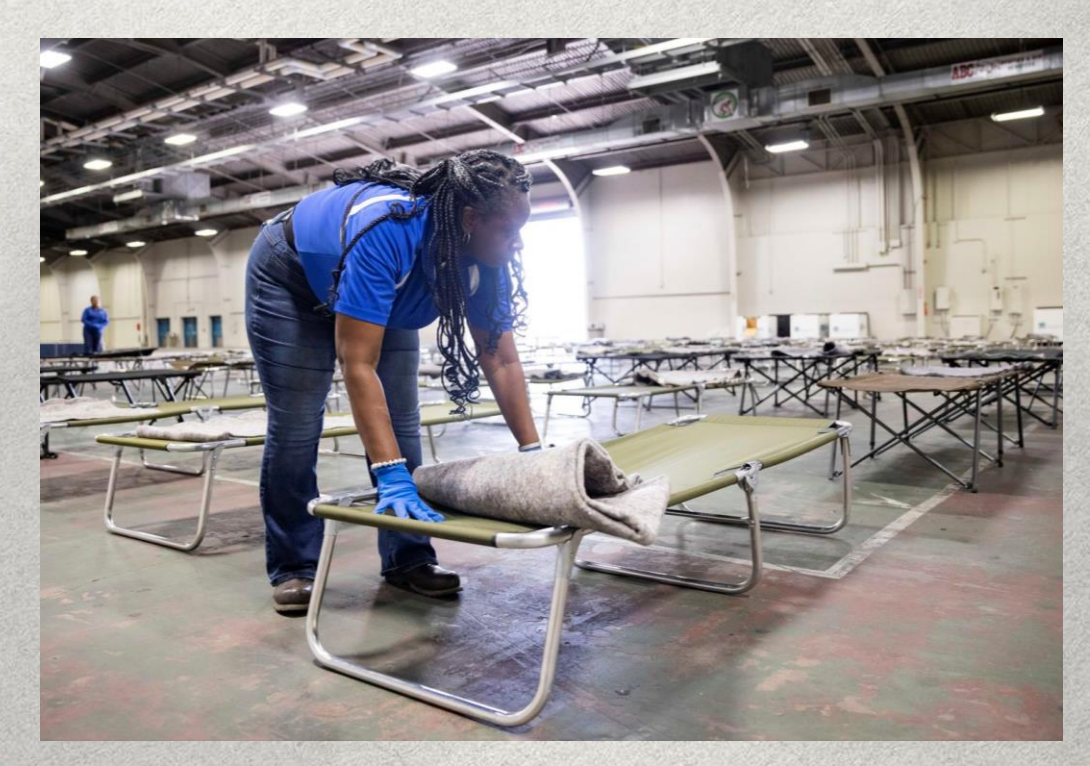
Winter Storm Warming Shelter