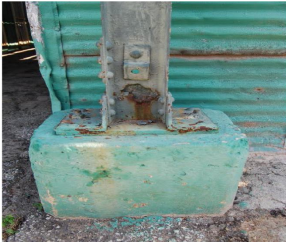
6 Dallas Park & Recreation