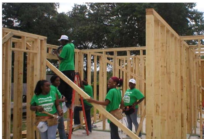
Dallas ISD students helped build houses in Joppa neighborhood as part of summer program.

The graduation and ribbon cutting celebration were held on August 2 and August 10 respectively. The graduation was at Science Place at Fair Park. The ribbon cutting and handing over of house keys was held at 4719 Yancy Street in Joppa.