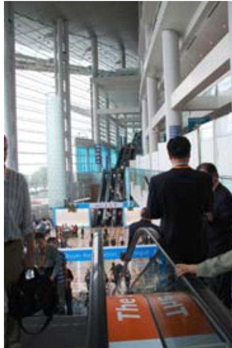
Inside the Hong Kong and Exhibition Centre