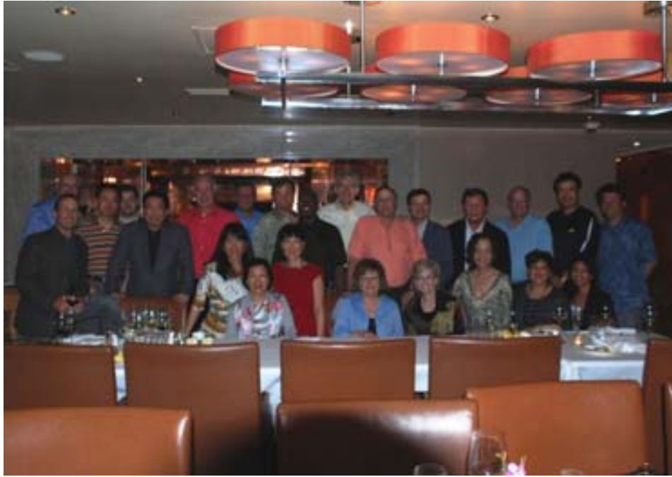
A Final Shot of the Mayor's Trade Delegation