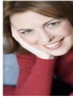
Nicole Johnson, MA, MPH, Miss America 1999 & Host dLife TV Luncheon Keynote Speaker