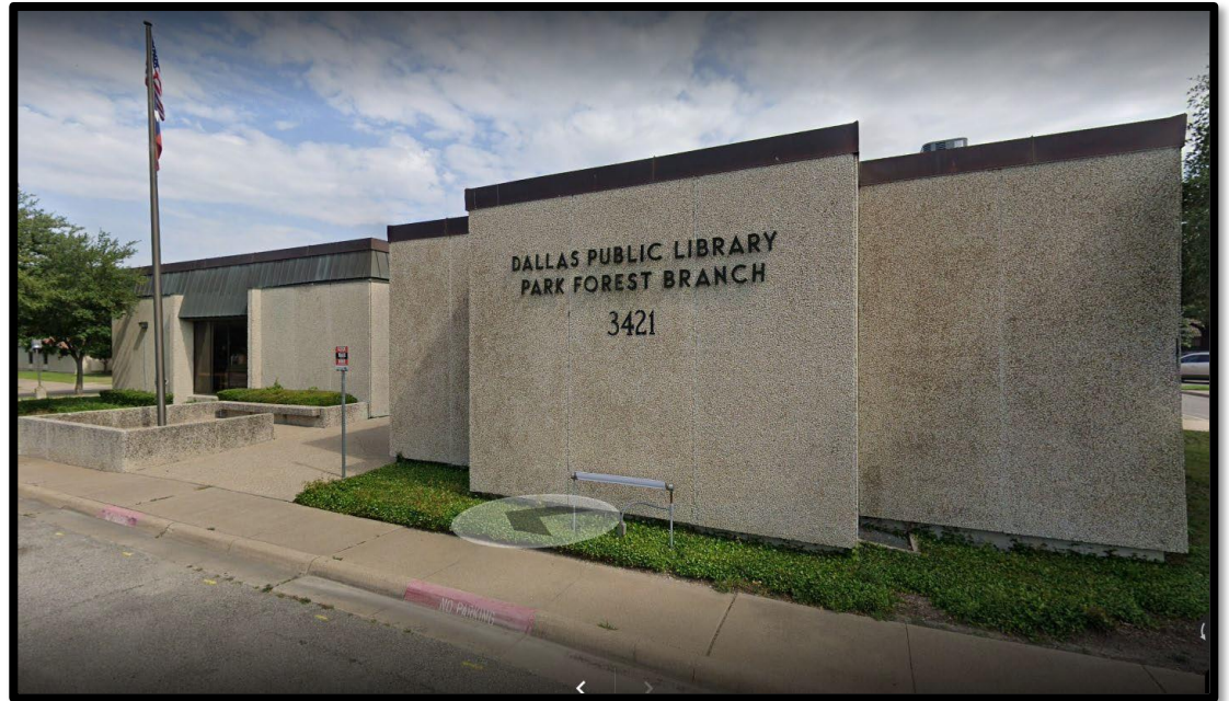
Park Forest Branch Library