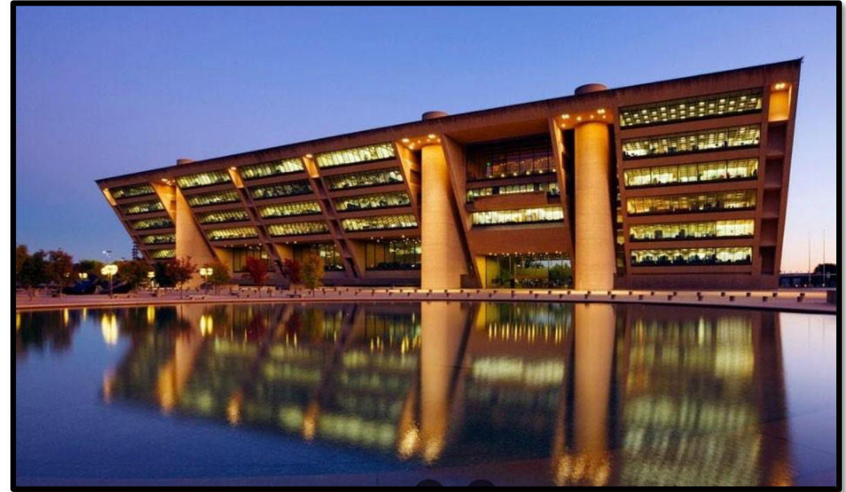
Dallas City Hall