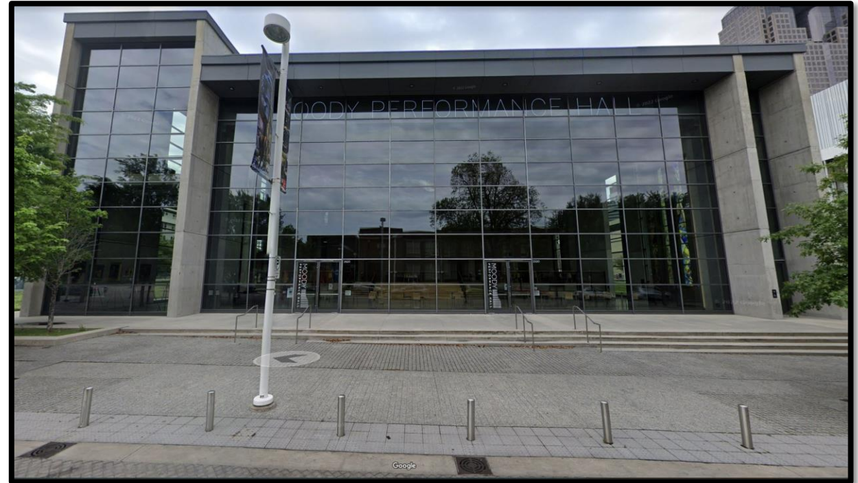
Moody Performance Hall

*Arts & Culture Needs Inventory now totals $166,826,868.56