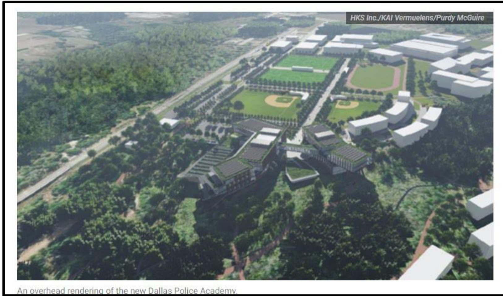
Dallas Police Training Academy at UNT Dallas