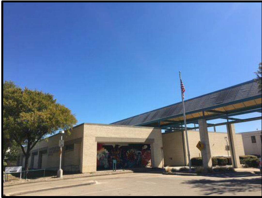
North Oak Cliff Branch Library