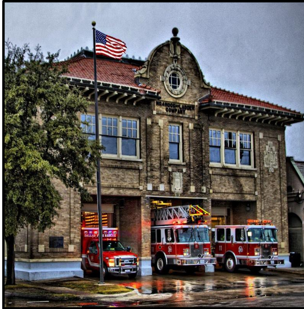
Fire Station 11