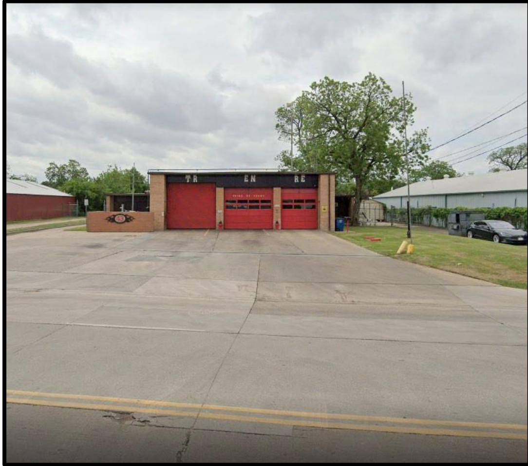
Fire Station 43