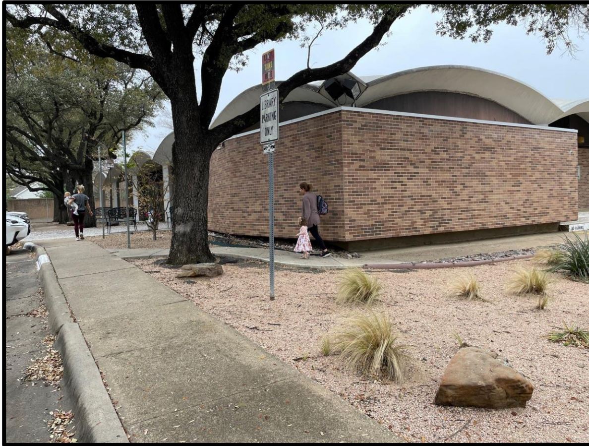
Preston Royal Branch Library