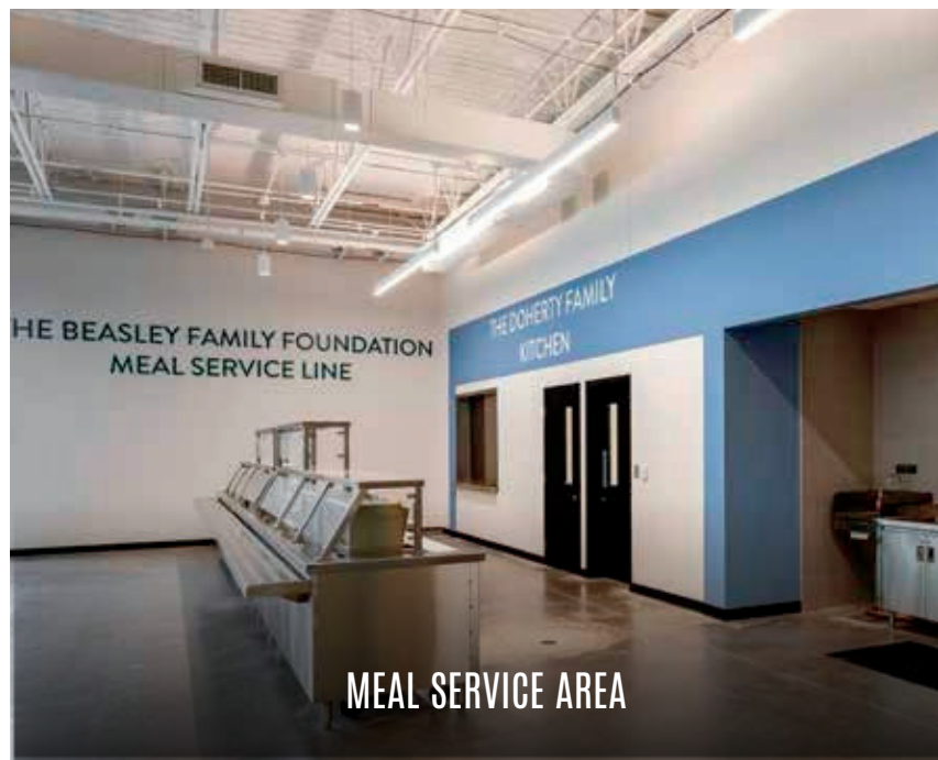
MEAL SERVICE AREA