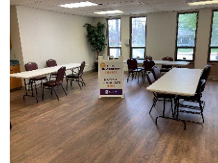
Emergency Shelter Showers