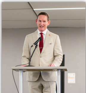
Dallas County Judge Clay Jenkins