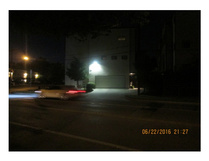
Violation abated – security light illuminating area.