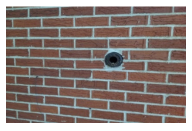
Missing Wall Clean-out Plug