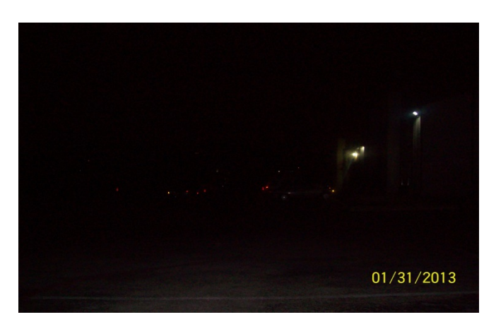
Violation - security light not in working order.