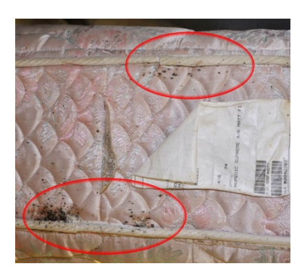
Bed bug blood trails from excretions and spots on walls. Bedbug found in mattresses.