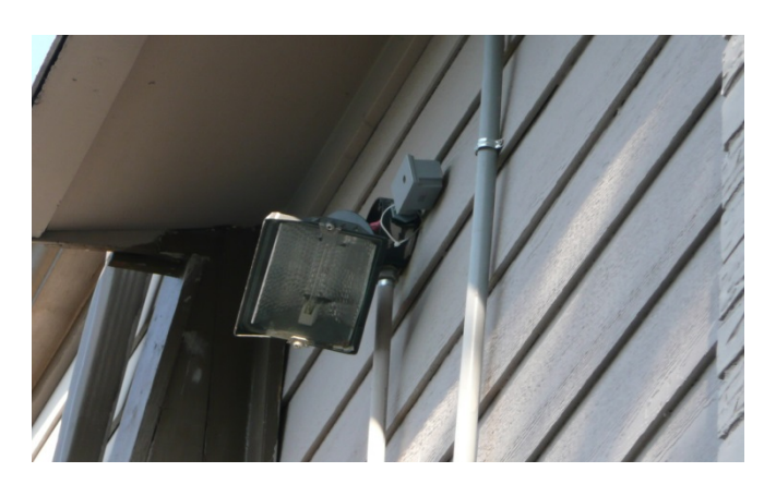
Violation – security light not in working order.