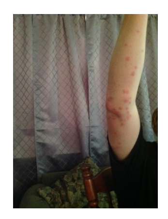
Bed Bug Bites on Occupants