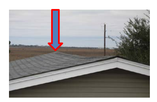
ROOF RIDGE SAGS