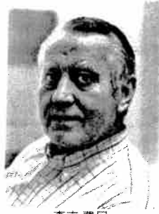
查克·費尼 (Chuck Feeney)

媒體追問查克·費尼，為何非要捐得一乾二淨？他的回答很簡單，因為「裹屍布上沒有口袋」。