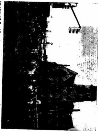
Thousands walk Detroit Prayer Walk around trip from Comerica Park to the Spirit of Detroit statue, April 16. At least 10,000 people turned out Saturday for the round-trip trek from Comerica Park to the Spirit of Detroit statue.

The sermon was indeed one of which motorcyclists could