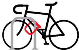
Figure DEF - A single U-lock securing both a wheel and the bicycle frame.