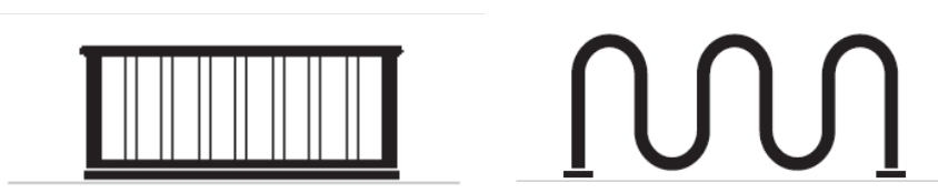
Figure GHI - "Grid"-style and "Wave"-style racks are not permitted.