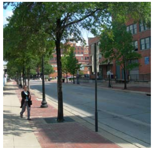
By monitoring tree canopy coverage throughout Dallas, the City can determine whether investments in natural landscaping contribute toward increased pedestrian activity.