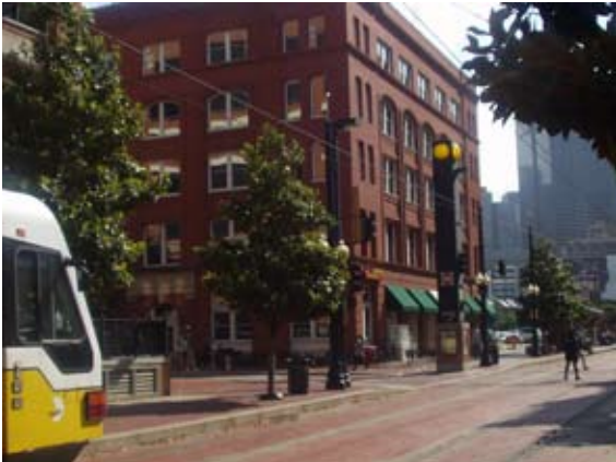
DART ridership data such as boardings by stop will help the City determine how investment in transit oriented development is facilitating new ridership.