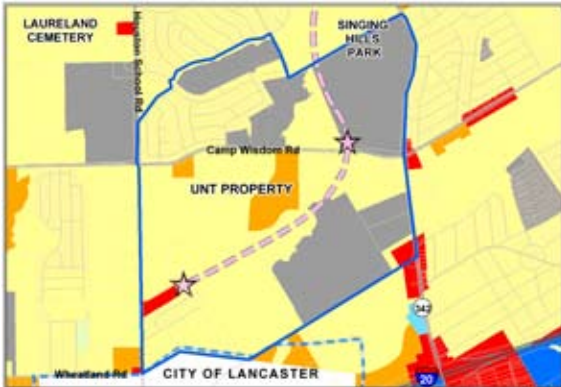
This is an example of a current zoning map for the UNT campus area.