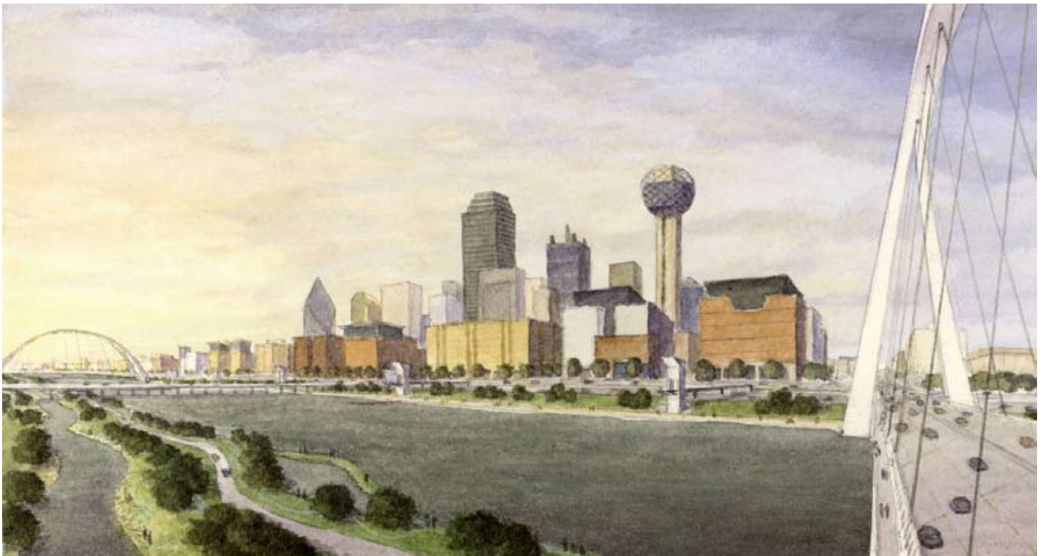
The Dallas of tomorrow begins today. The forwardDallas! Action Plan provides a roadmap and directions for ensuring that the Vision becomes a reality.