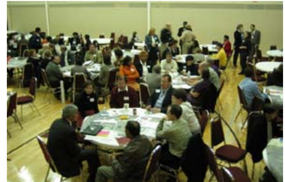
Public workshops and open houses are essential components of any planning process.