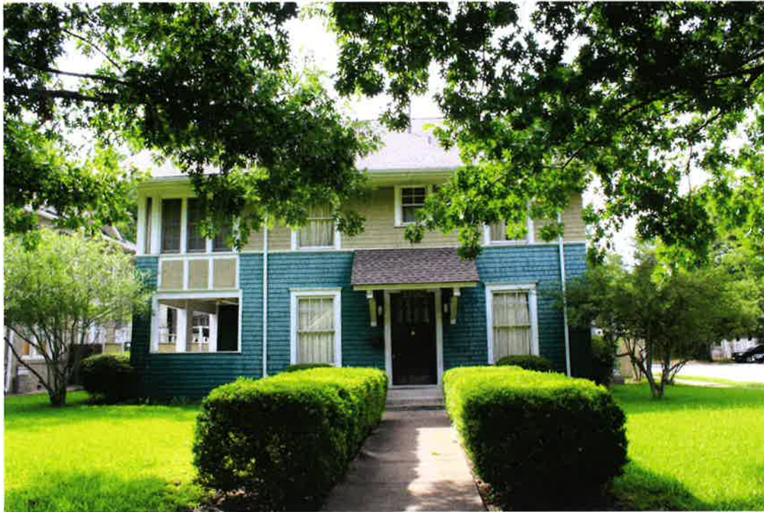
Figure 10 - 5000 Worth – prior to rehab