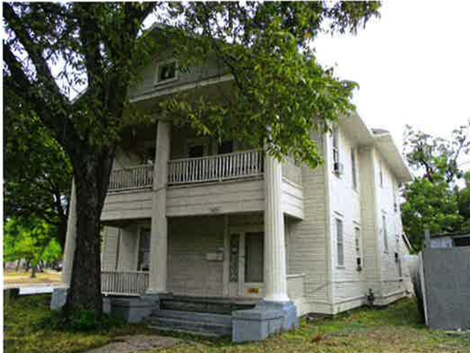
Figure 4 - 400 W. Tenth Street

Staff reviewed 101 properties within four existing demolition delay overlays. 8 properties qualified for the 'Phase II'. 400 W. Tenth Street was purchased and moved to Fouraker Street – not far from its original location – as a result of Phase II discussions. The remaining 7 properties were released for demolition since no viable options other than demolition were identified by the owners.