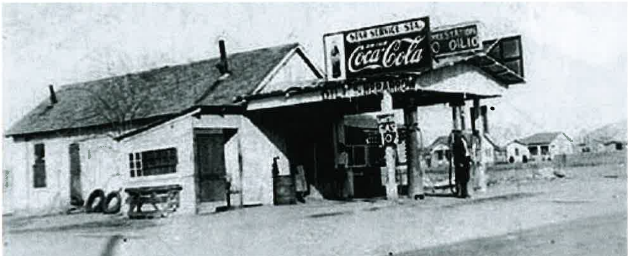
Figure 1 - Barrow Filing Station, date unknown - (image from https://texashideout.tripod.com/Ford.html )