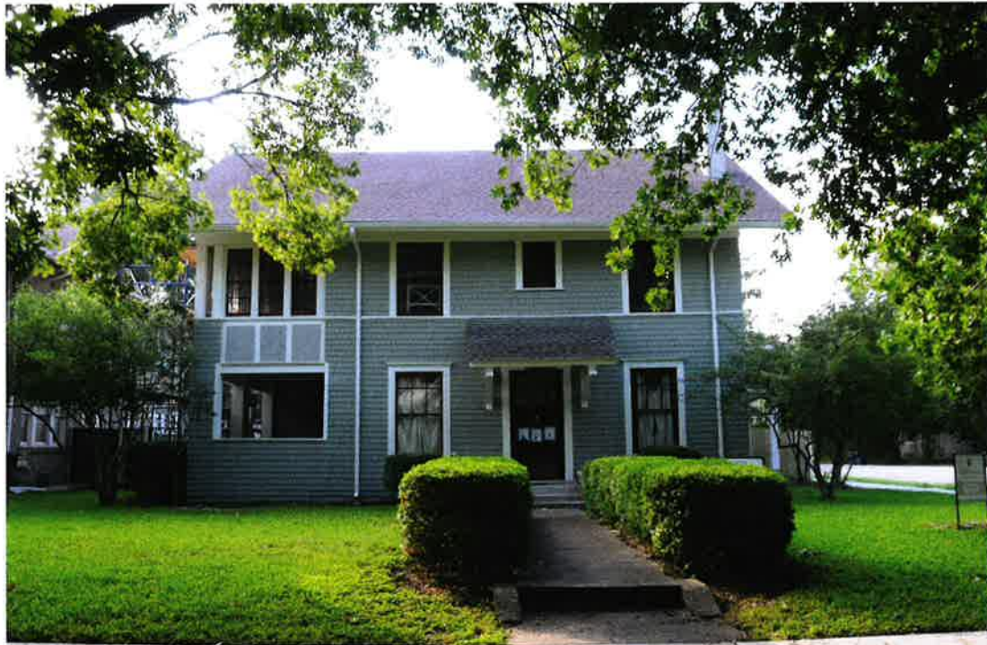
Figure 11 - 5000 Worth – Post rehab