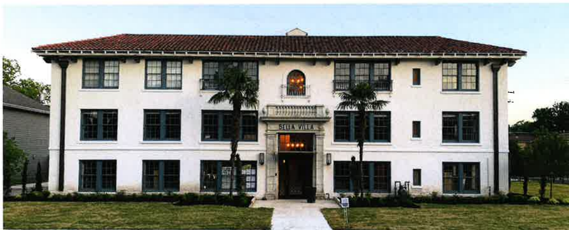
Figure 3 - Bella Villa Apartments