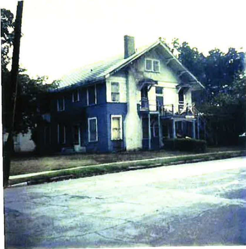
Figure 9 - 5000 Worth (1982)