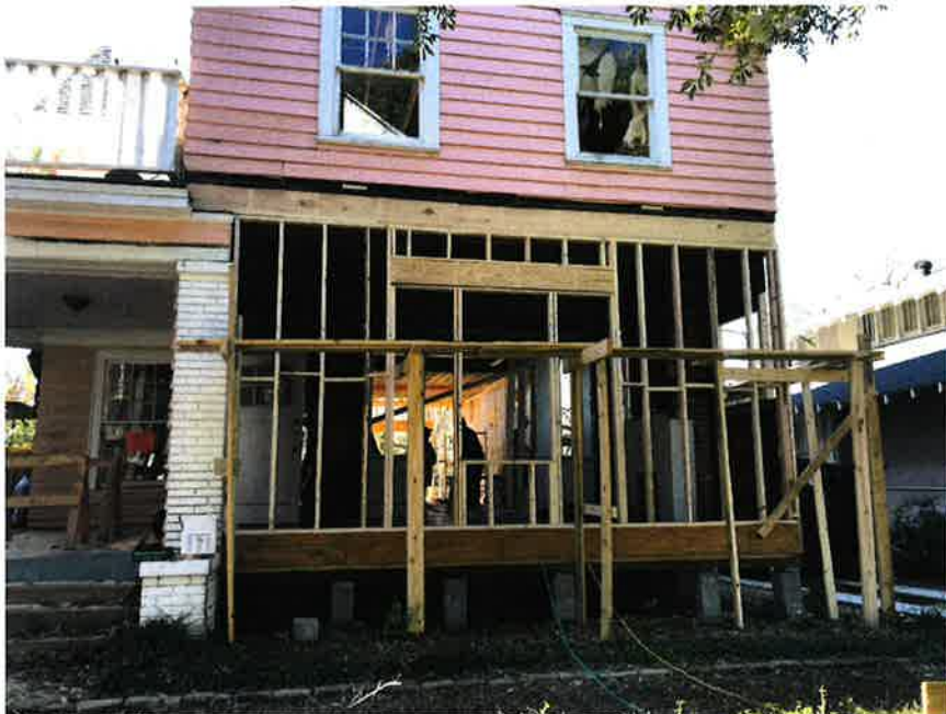
Figure 7 - 105 S Willomet – during restoration/rehabilitation