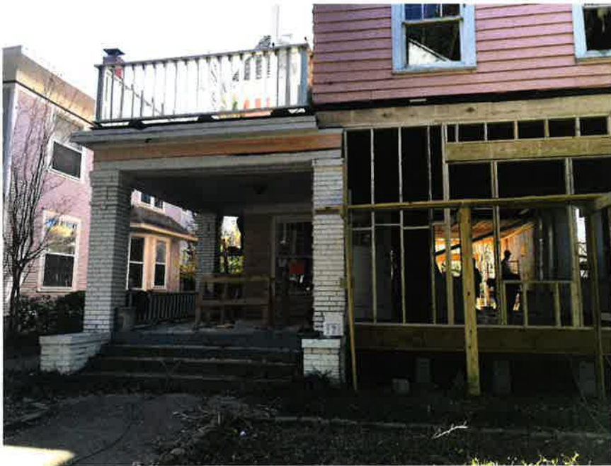
Figure 6 - 105 S Willomet – during restoration/rehabilitation

The Landmark Commission approved 10 Certificates of Eligibility for Tax Incentives *and upgraded status of 2 properties from non-contributing to contributing.