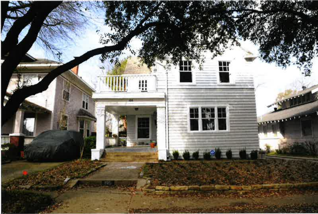
Figure 8 - 105 S Willomet Post-rehab