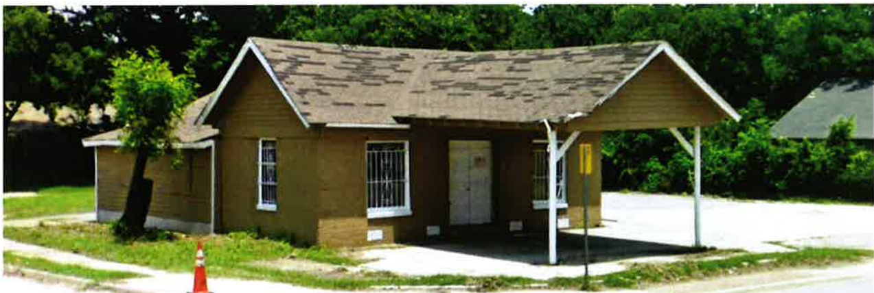
Figure 2 - Barrow Filing Station, 2020