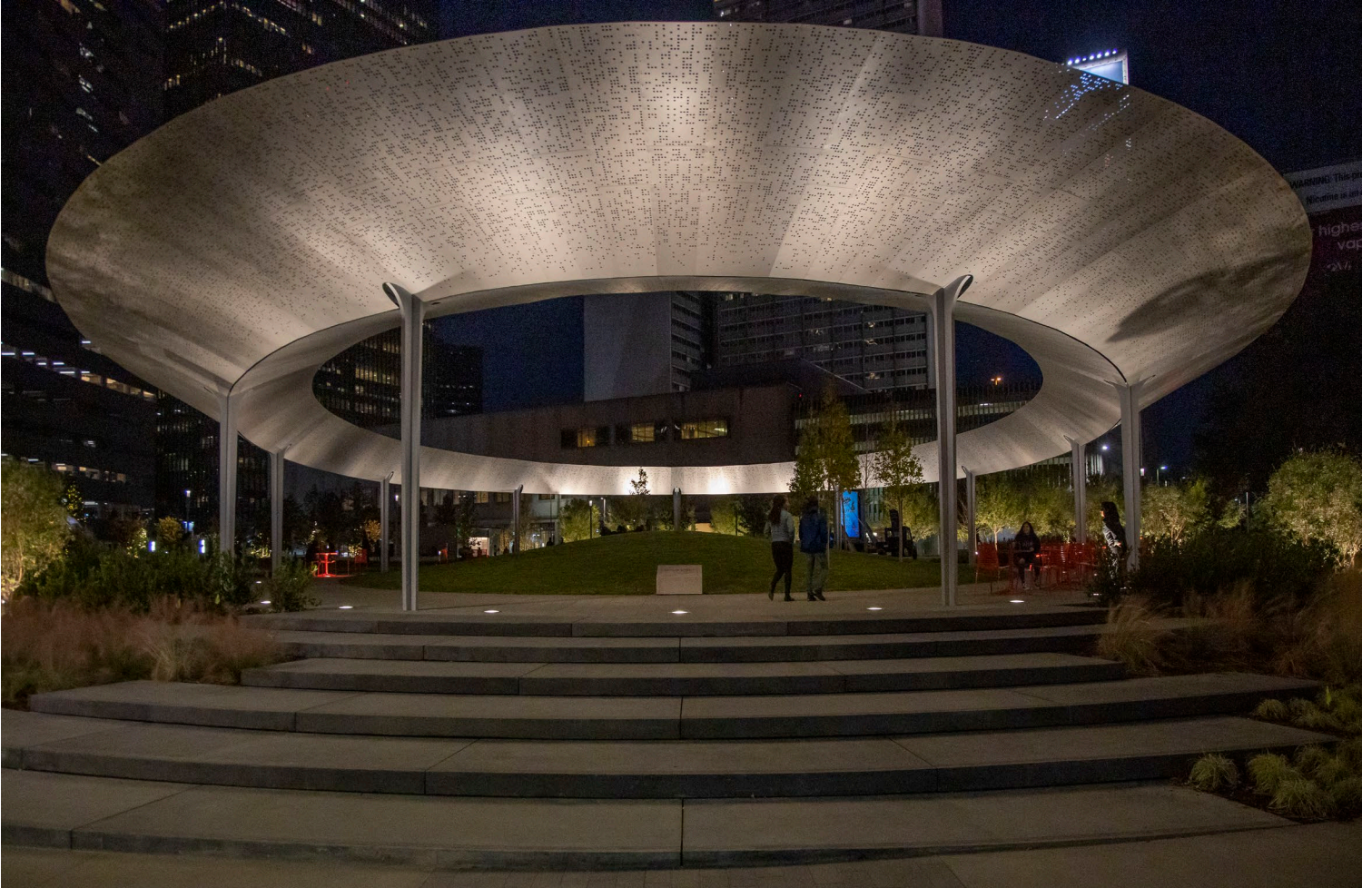
Pacific Plaza at night