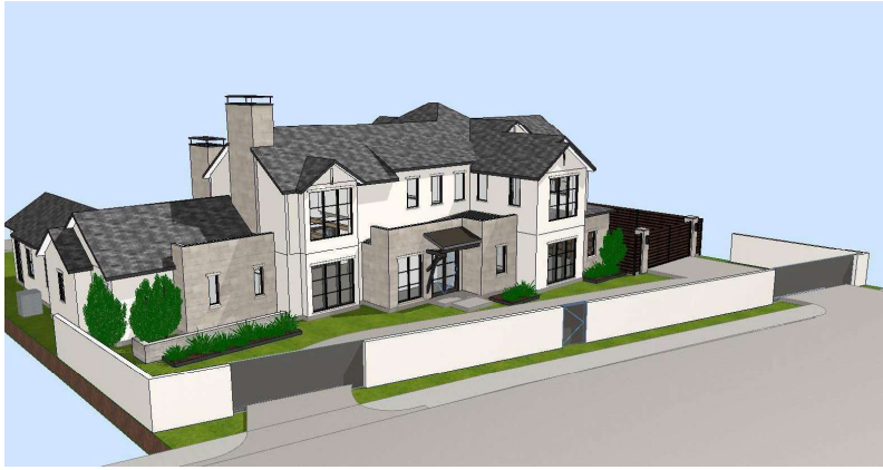
Front Yard View

BIMbaud - designshopdallas - BIMbaud Software as a Service/Libraries/Design Shop Projects/6452 Walnut Hill - 02-11-26