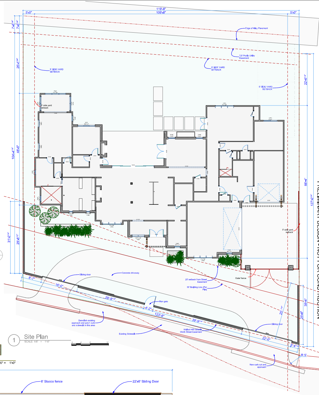
1 Site Plan SCALE: 1/8" = 1'-0"