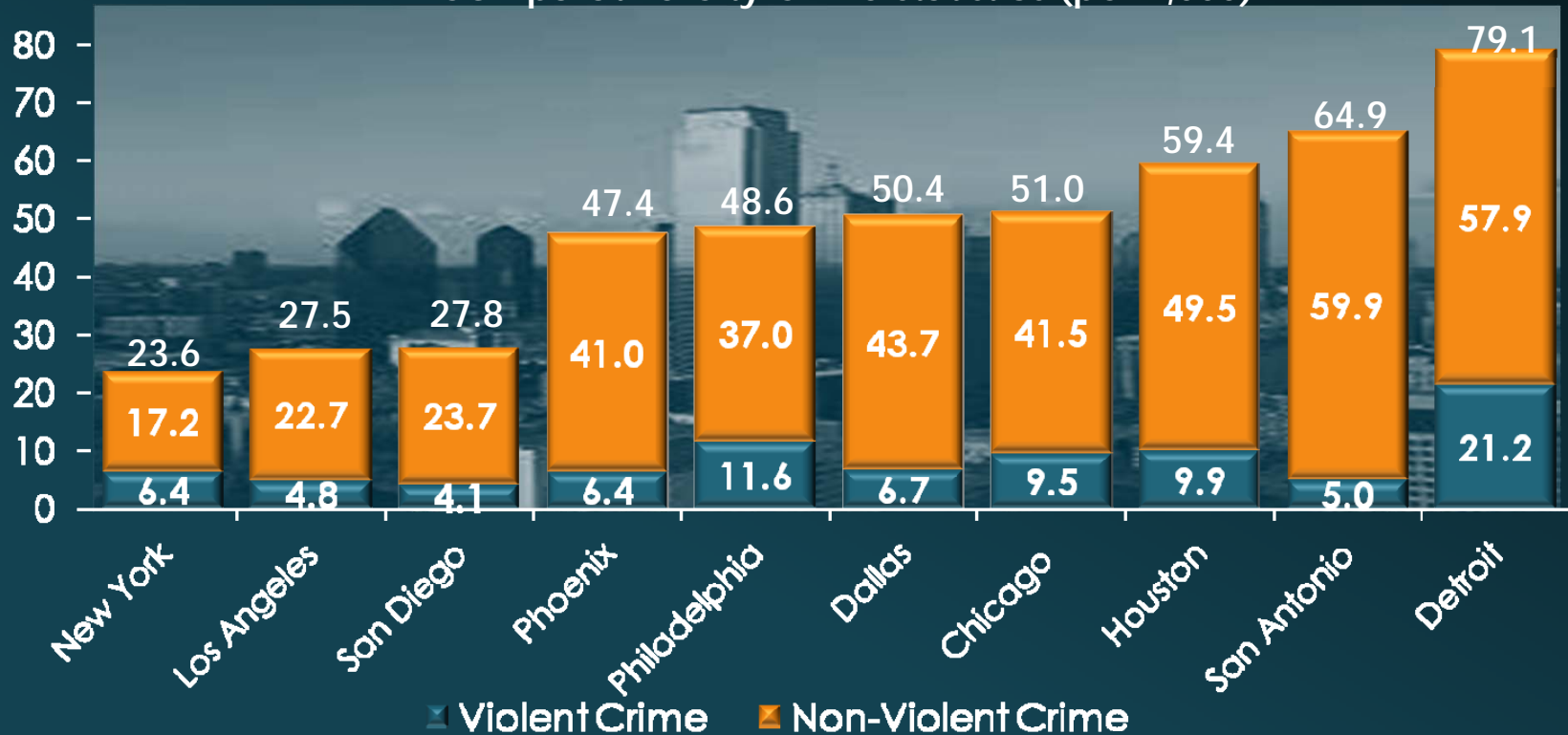
Comparative City Crime Statistics (per 1,000)