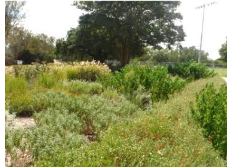
Crawford Memorial Park