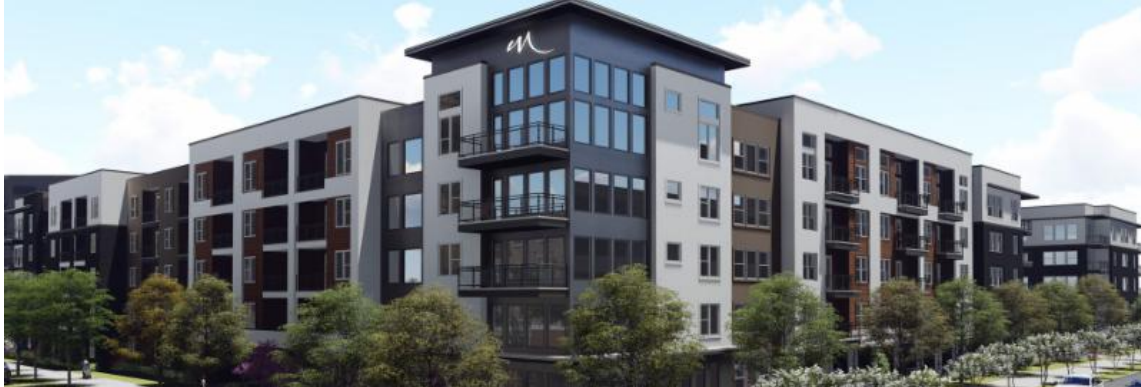
Mill Creek Modera Apartment Rendering