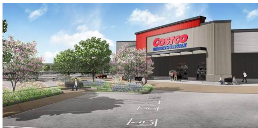
North Dallas Costco Wholesale rendering.