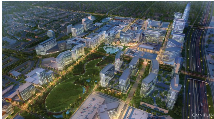
Dallas Midtown Park

Dallas Midtown Project is still under way, and District 11 is proud of plans to redevelop the Valley View Mall area. As we continue to work with the developers, progress to date includes demolition of the Macy's store, a 5 story apartment complex, and a 20 acre park.