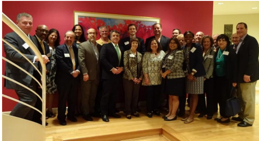
District 11 Board & Commission Dinner

Email: District11@DallasCityHall.com Telephone: 214-670-7817