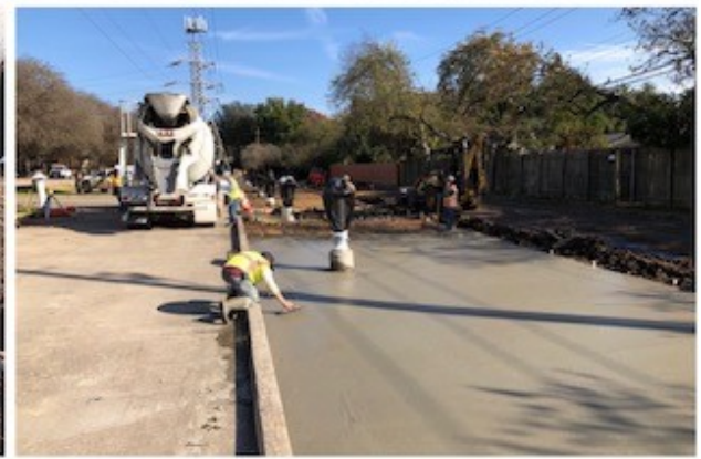
All photos were taken looking East to West along the Northaven Trail, Phase 2A section