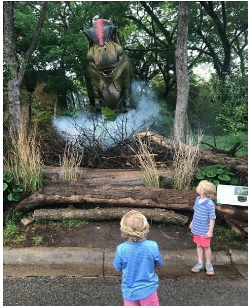
My grandsons recently enjoying the Dinos event at the Dallas Zoo