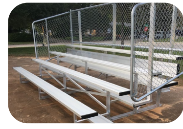
Public Improvement/ Infrastructure