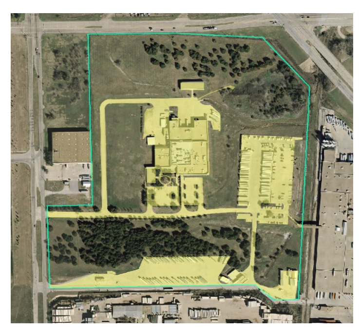
Campus Style Office Building