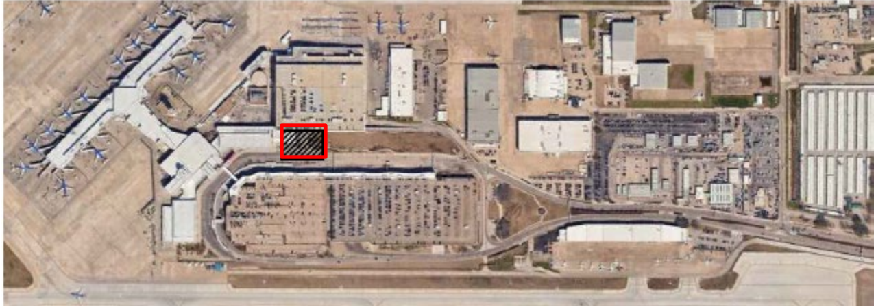
Terminal Area View - TNC pick-up location

Although this site has the potential to create bottlenecks in traffic flow upon exiting the valet pavilion during peak periods, mitigation tactics are in progress to minimize disruptions. A marketing plan will proactively notify customers of the parking rate changes and pending TNC relocation starting next week, and we are soliciting your assistance in sharing these key messages through available multi-media district channels. For additional questions or concerns, please contact Patrick Carreno, Director of the Department of Aviation at 214-670-6149 or patrick.carreno@dallas.gov .