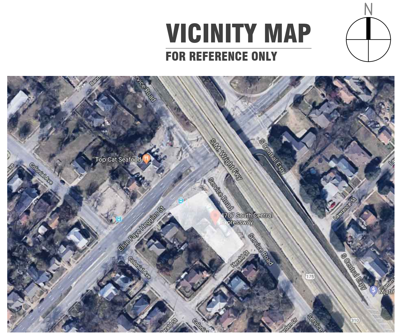
VICINITY MAP FOR REFERENCE ONLY