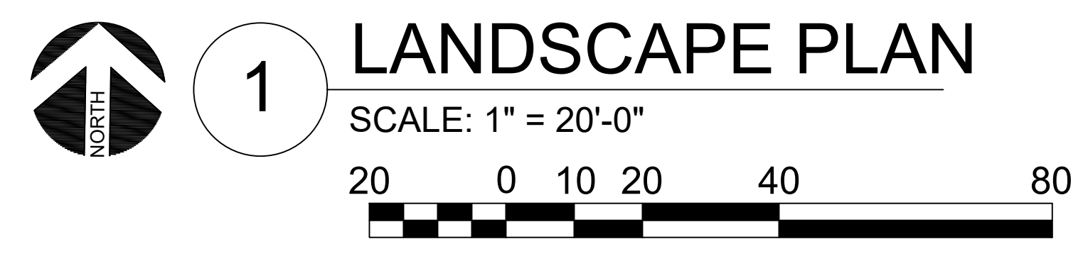
1 'AS BUILT' LANDSCAPE PLAN SCALE: 1" = 20'-0"