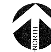
SITE DATA TABLE 510-520 HASKELL