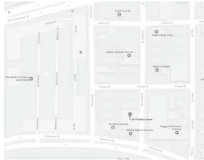
LOCATION D DATE: N/A 01/22