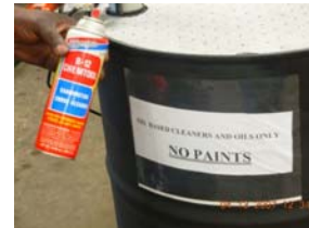
No – Ensure proper compatibility