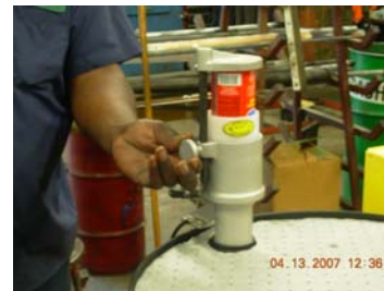
Yes – Ensure can is properly secured