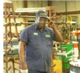
Yes – Ensure that appropriate PPE is used