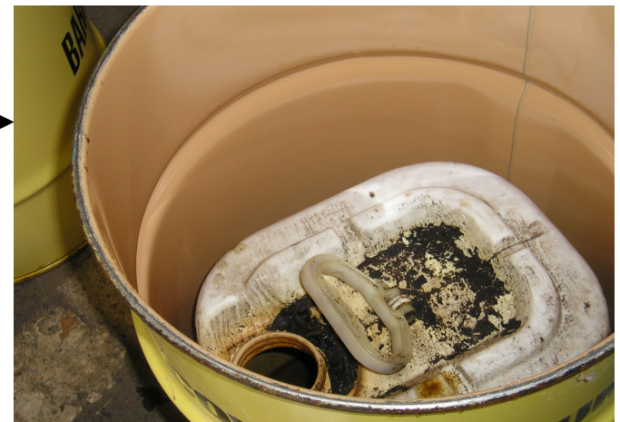
Yes - Place leaking containers into overpack drums

Important! - Place leaking and damaged containers into appropriate sized overpack containers