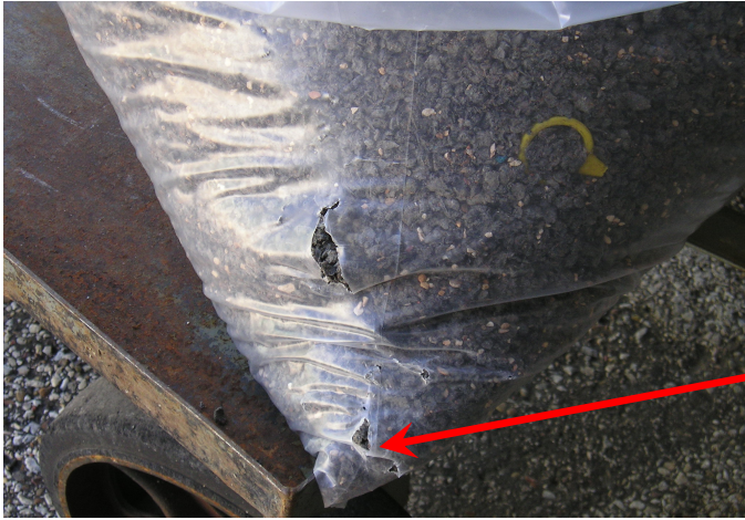
Don't Forget - to inspect containers for damage