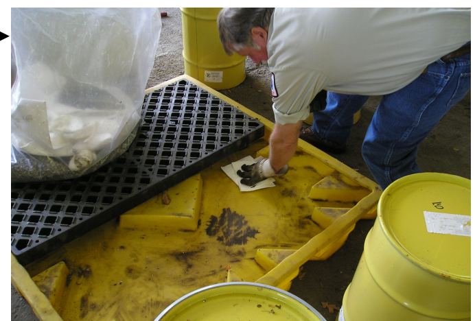
Yes - Clean up all spills

• Clean up all spills and work area • Clean all tools used • Replace tools and unused materials to their proper place