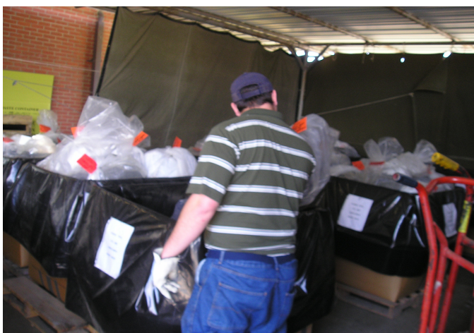
Don't - Store containers in the wrong place