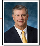
61st Mayor of Dallas Michael S. Rawlings

Data Source: Roads, Council Districts - City GIS Services Communication & Information Services Department ENTERPRISE GIS Date: Wednesday, December 12, 2018 10:06:56 AM Project Name: CouncilSmall File Location: U:\State\Map\2018\20181212_ReviseCouncilSmall.mxd Prepared By: Kevin S. Burns Property of: City of Dallas Enterprise GIS for Illustrative purposes only.