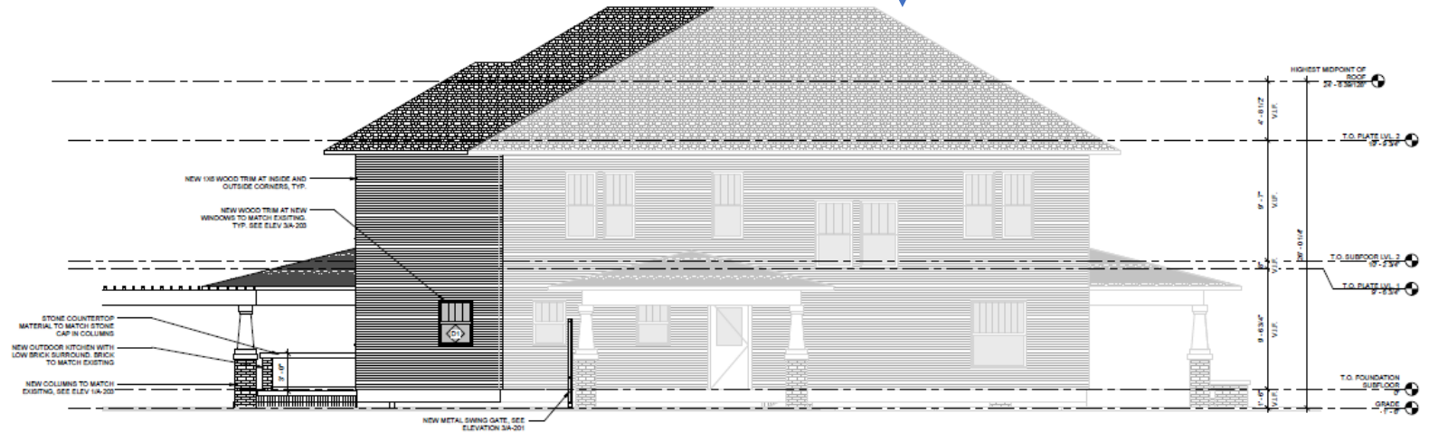
2 WEST EXT. ELEVATION 1/8" = 1'-0"