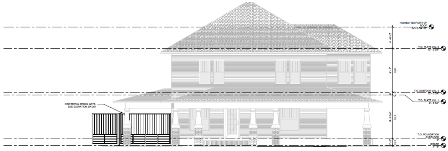
2 SOUTH EXT. ELEVATION 1/8" = 1'-0"

No changes from this façade except for fence