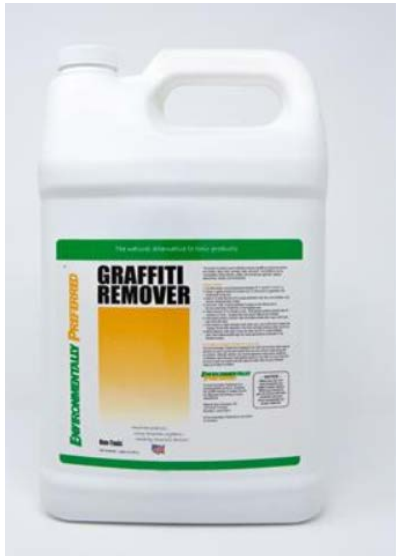
Graffiti Remover by Natural Soy Products.

Effective, water soluble non-toxic paint remover. Remove graffiti such as spray paint , black paint, enamel paints, permanent marker, inks etc. without damaging the environment or humans. Same formula as SoyClean. Rinse away paint remover with water. 100% natural, soy-based, non-toxic product. Most other graffiti removers