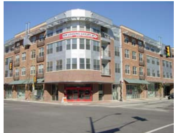
New homeownership opportunities in Dallas will provide a mix of housing types from luxury condos (top) to affordable units for first-time homebuyers.