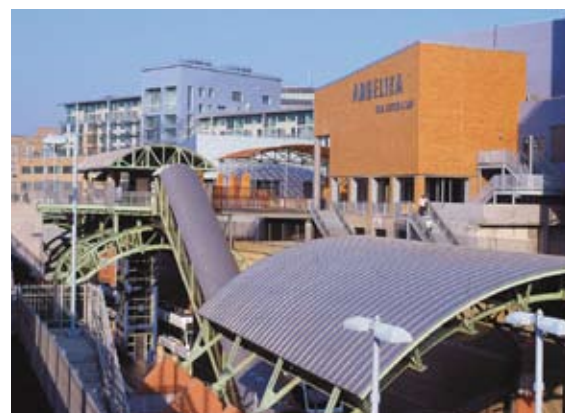
New housing near transit stations, particularly near DART, is a cornerstone of forwardDallas! Zoning regulations for DART stations (Westmoreland Station at top) should be designed to attract new mixed-use development such as Mockingbird Station (bottom) and redevelopment such as Southside on Lamar in the Cedars (middle).