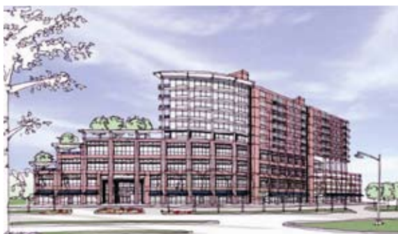
Higher density housing ranging from high-rise towers (above at 1400 Turtle Creek) to low-and mid-rise buildings will be important if Dallas is to accommodate a projected 200,000 new households.

G oals and Policies of the Housing Element are organized into three classifications: supply, demand and affordability. Some issues, such as ownership, which is impacted by affordability and supply, are addressed under more than one classification.