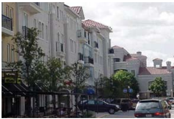
New zoning regulations should encourage the development of mixed-use buildings as illustrated above.