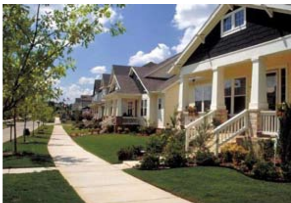
Developments like Capella Village will enable the Southern Sector to attract a stable middle class to the area.

Targeted efforts to increase homeownership opportunities for Blacks and Hispanics will be critical to establishing a higher percentage of homeowners in the city.