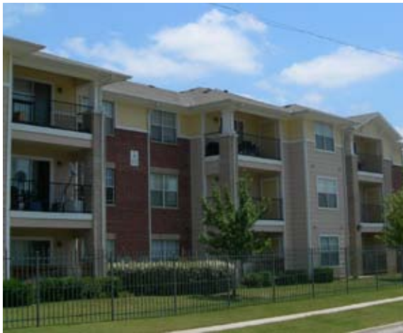
Eban Village is an example of quality affordable housing in South Dallas developed by the SouthFair Community Development Corporation.

less affluent areas where renting is common and promote a broader mix of housing in all neighborhoods.