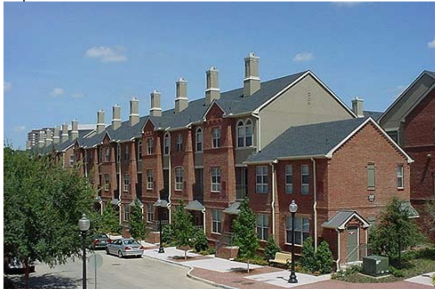
New housing types such as these townhomes will comprise the majority of new housing development in Dallas.