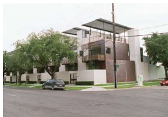
Smaller lot homes, and other alternatives such as townhomes and condominiums, will enable more Dallas residents to become homeowners.