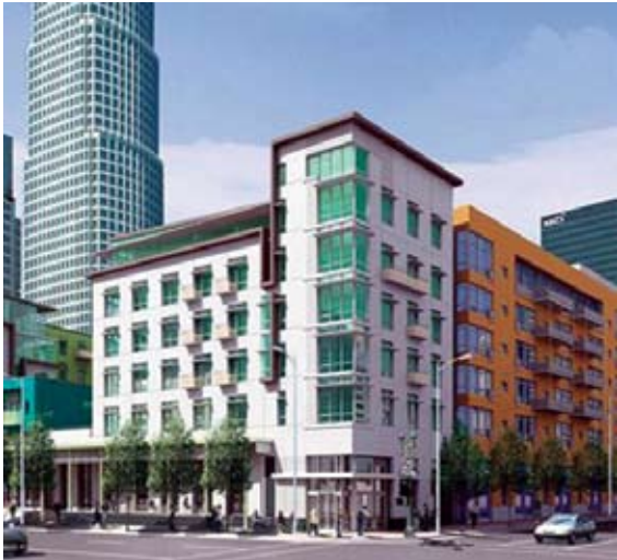
Mixed income neighborhoods will ensure that Dallas maintains a vibrant and healthy urban core that is supportive of homeownership.

investments, making sure these improvements serve residents in their primary function, but also support other goals of the City.