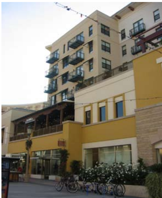
New housing should also include services and amenities targeted toward newcomers.