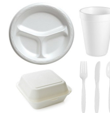
Styrofoam & Plastic Utensils