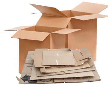
Cardboard & Boxboard