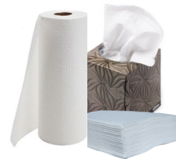
Paper Towels & Tissue Papers