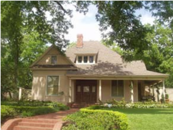
Monitoring homeownership rates by council district will help the City determine whether it is meeting its housing targets and to what degree.