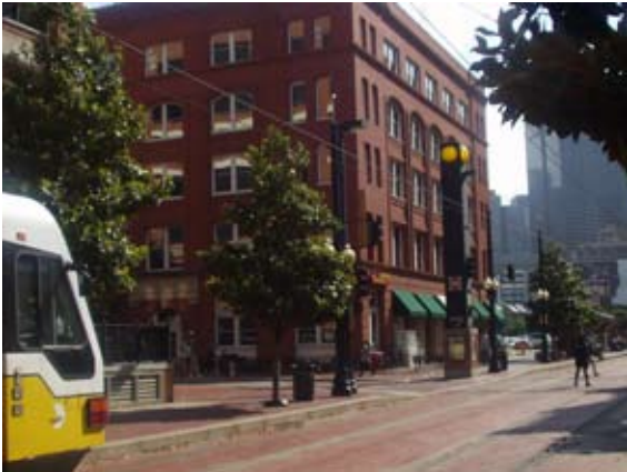
DART ridership data such as boardings by stop will help the City determine how investment in transit oriented development is facilitating new ridership.