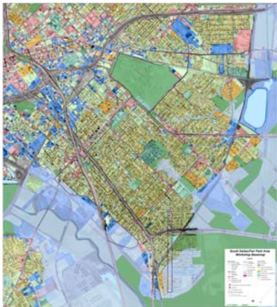
Map II-7.2 South Dallas Base Map