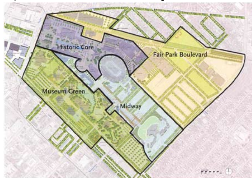
Map II-7.3 Area Plan for the Fair Park Neighborhood

This map of an Area Plan for the Fair Park neighborhood provides a good example of consensus-driven planning.