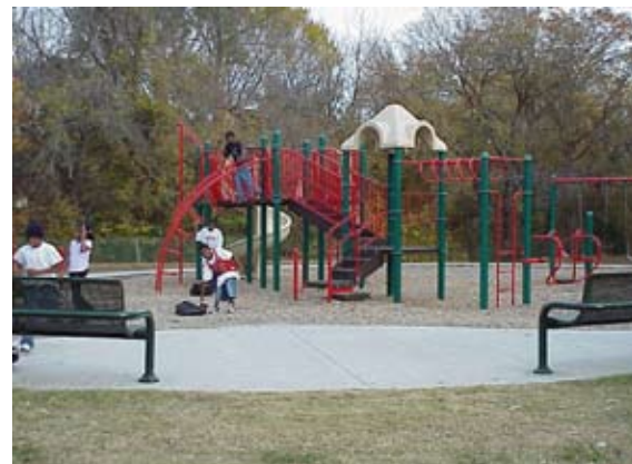
Neighborhood parks provide family recreation areas close to home.