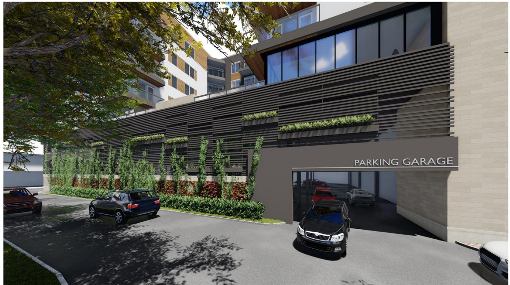
WEST FACADE & PARKING GARAGE SCREENING