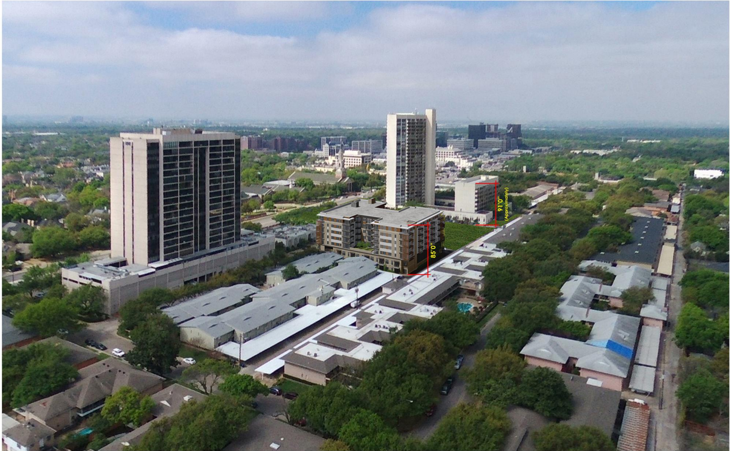
- AERIAL VIEW -