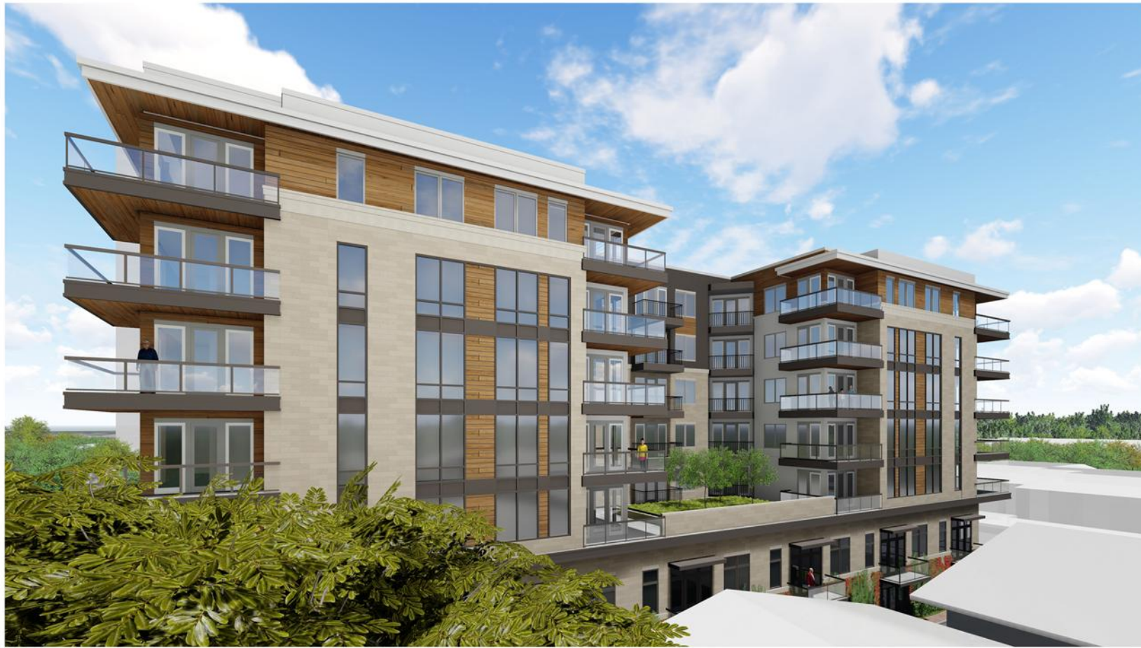
EAST FACADE & COURTYARD