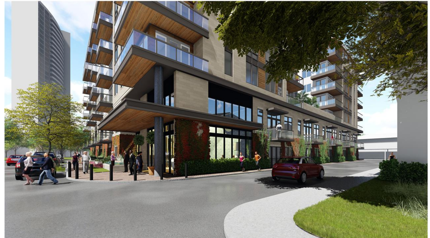
- BUILDING RENDERINGS -