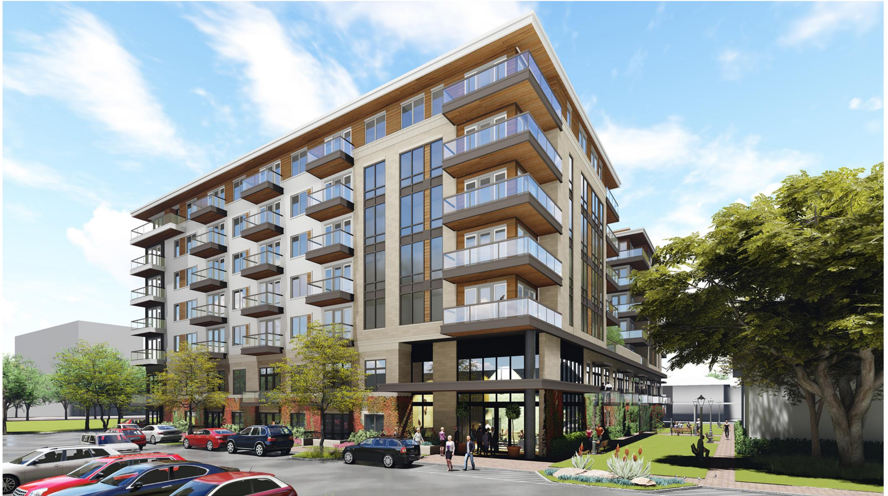
GROUND LEVEL at DIAMOND HEAD CIRCLE