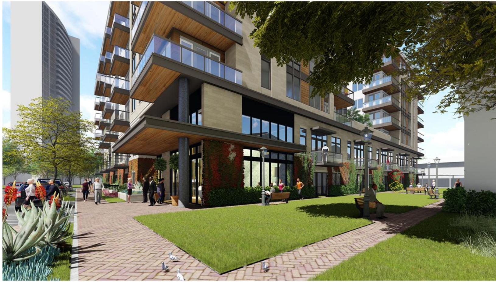
CONCEPTUAL COMMUNITY "POCKET PARK"