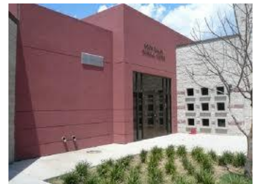
South Dallas Cultural Center Exterior View