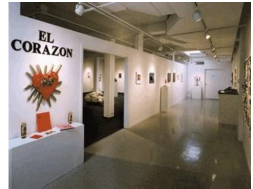
Bath House Cultural Center Interior View